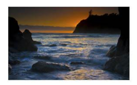
Ruby Beach Sunset-Sherrie Tallman