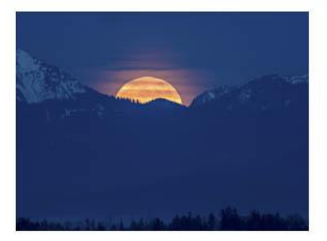
First Moon Rise 2018 reg images - Gr