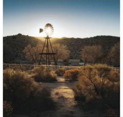
Windmill at Sunset-Don elliott