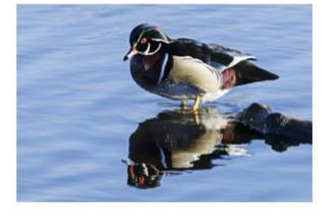
Jaunita Bay Wood Duck - Steve Lightl