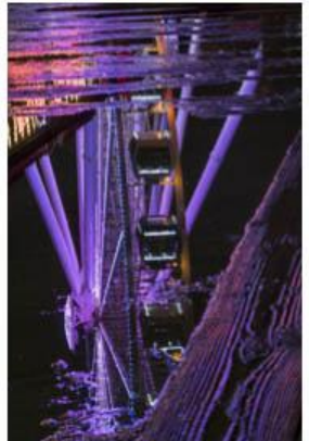
Great Wheel Abstrat Reflection-Paula