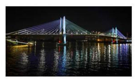
Tillikum Crossing Bridge-don elliott