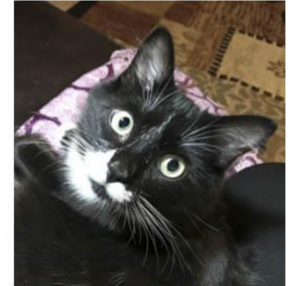
Mercurio - Sonia Rahm