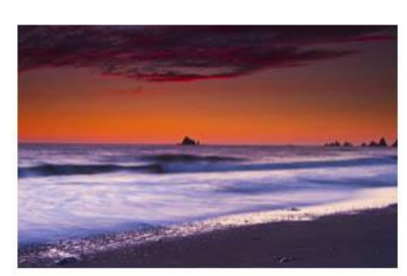
Rialto Beach Sunset-SherrieTallman