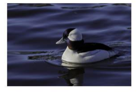
Male Bufflehead - Steve Lightle