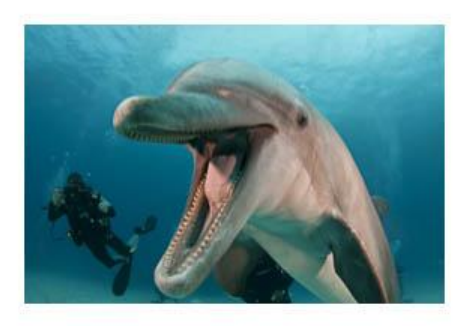
Happy_Dolphin - Dan Clements