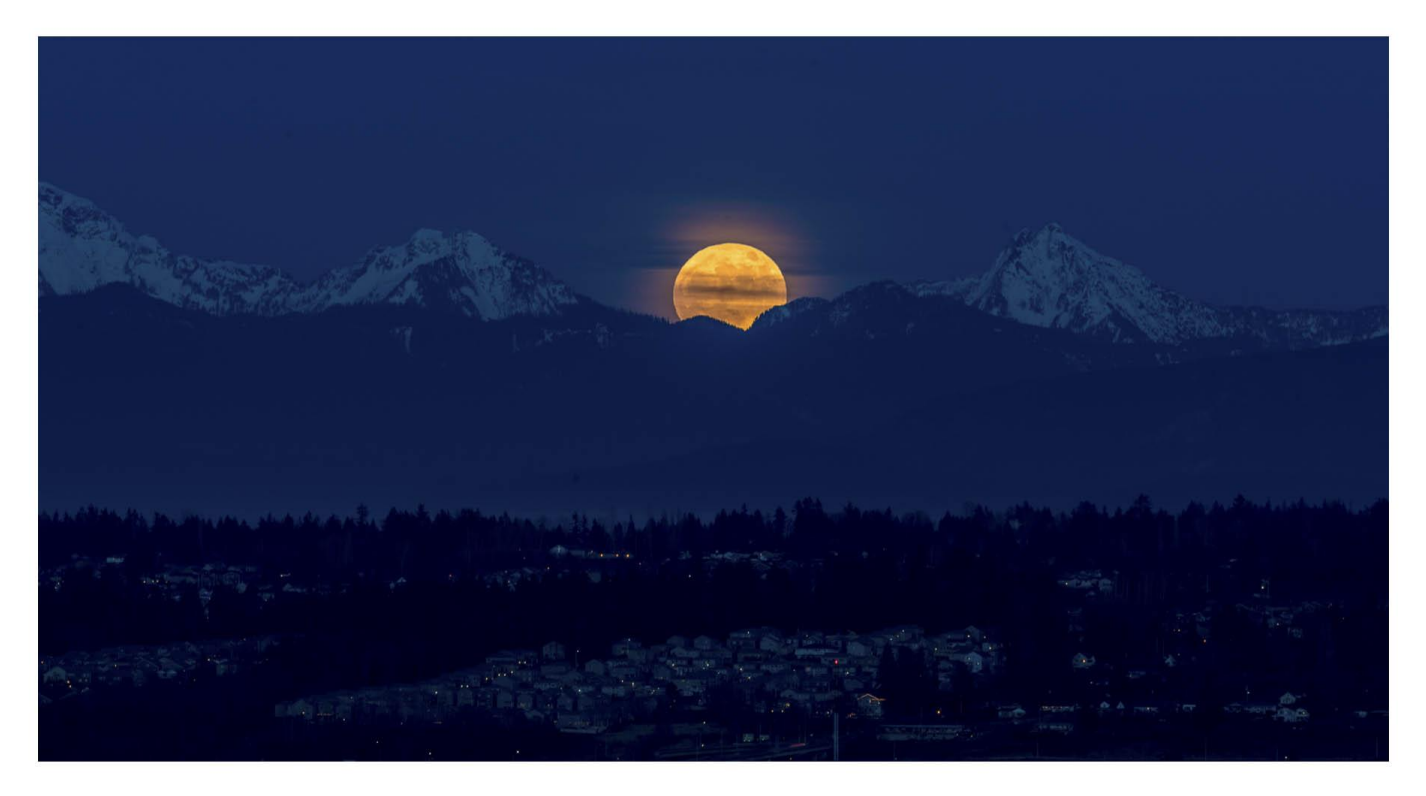
January 2018 Supermoon Rising-Paula Kelley