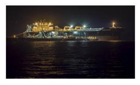
Spy Movie Scene reg images - Greg