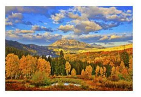
Kebler Pass - Renata Kleinert