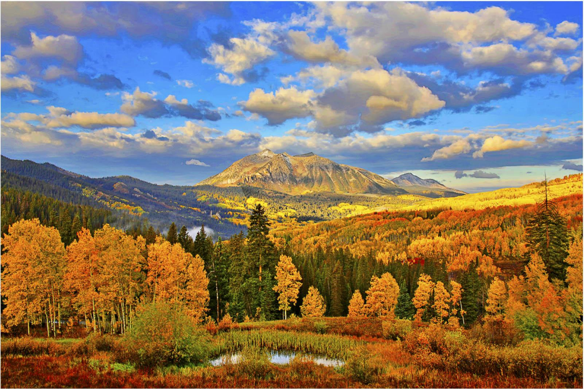
Kebler Pass - Renata Kleinert