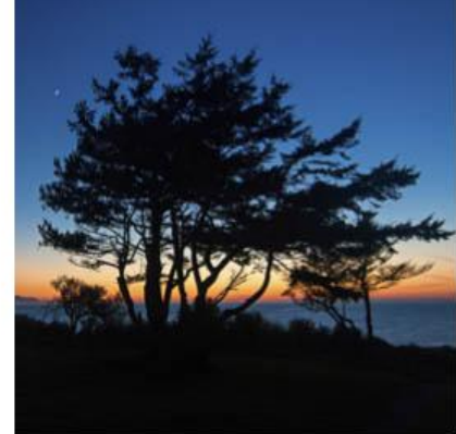
Tranquil Sunset-Sonya Lang