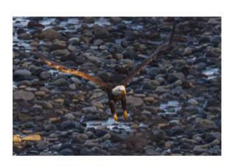
Into The Light - Bill Schwarz