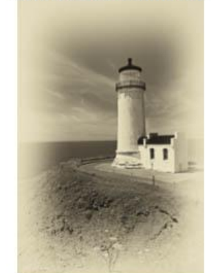
Cape Disappointment - Bill Schwarz