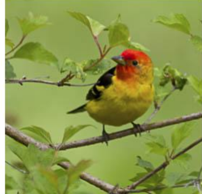
Tanager - Bill Schwarz