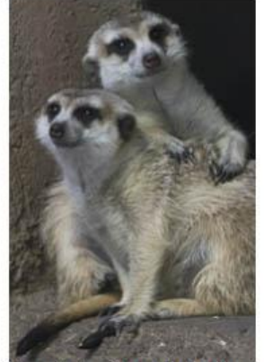
Meerkat - Renata Kleinert