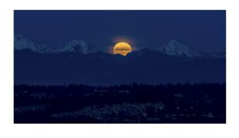
January 2018 Supermoon Rising-Pau