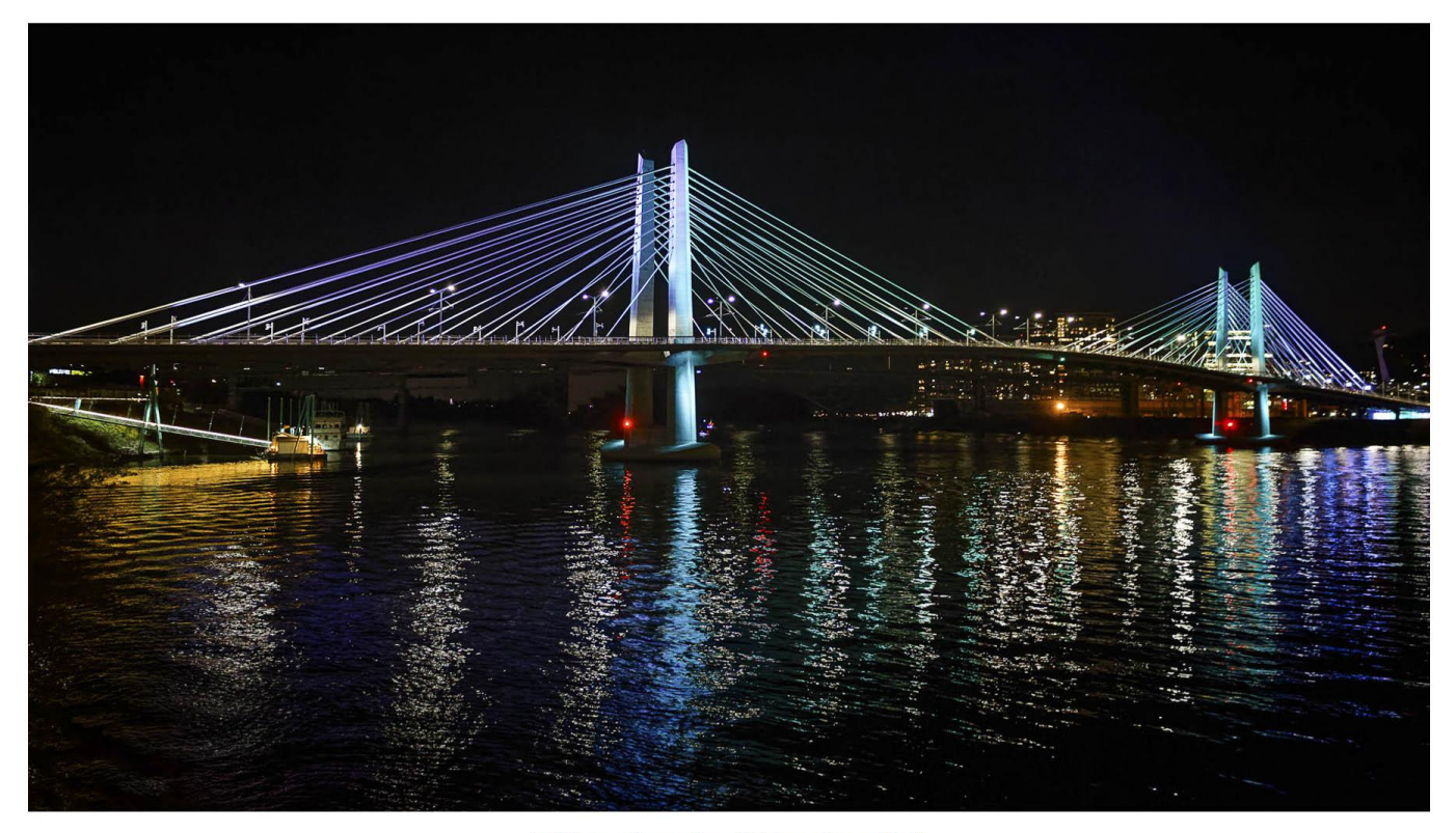
Tillikum Crossing Bridge-don elliott