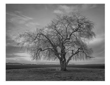
Lone Tree Skagit Valley reg images -