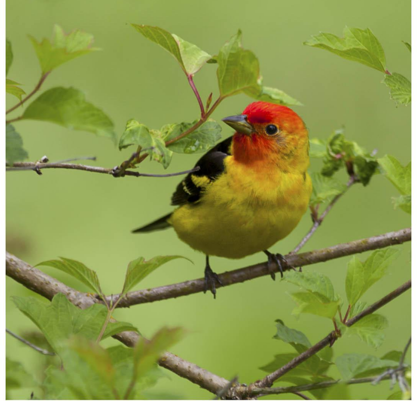
Tanager - Bill Schwarz