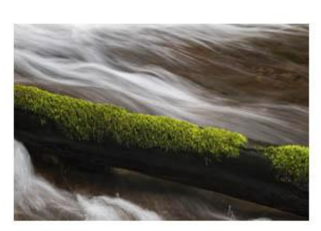
Mossy Log sweet Creek -don elliott