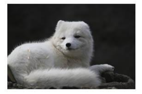
Artic Fox-Jim Basinger