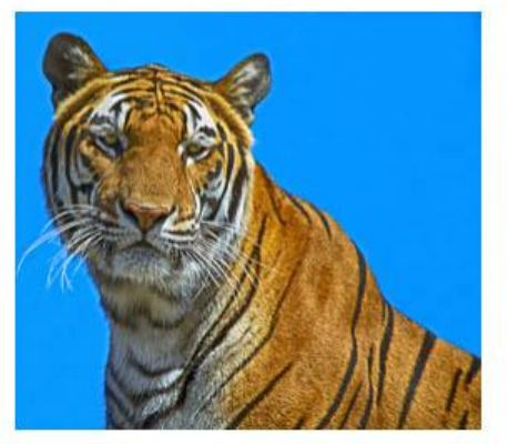
Bengal Tiger - Renata Kleinert