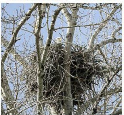
Nesting - Jim Rahm