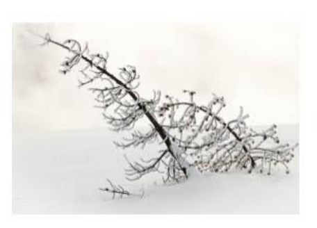
Winters Canvas-Sonya Lang