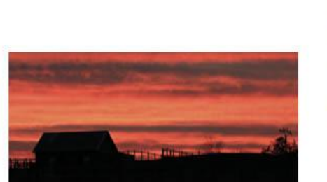
country sunset-Paula Bailly