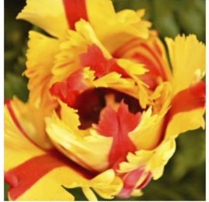
Tulip Flow - Jennie Bouma