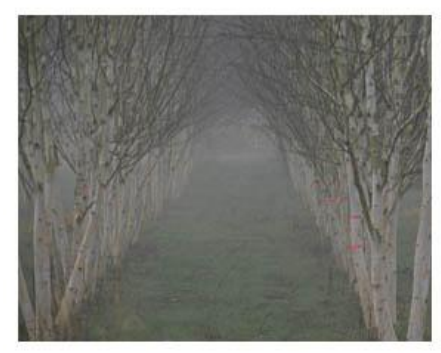
Birch Trees in the Morning Mist- Soni