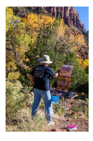
"Painting At Zion" © Bill Schwarz