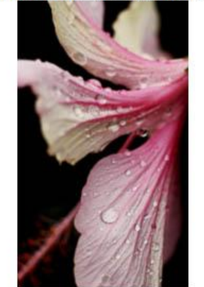
side of hibiscus -Paula Bailly