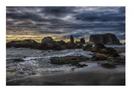
Bandon Beach Sunset - Bill Schwarz