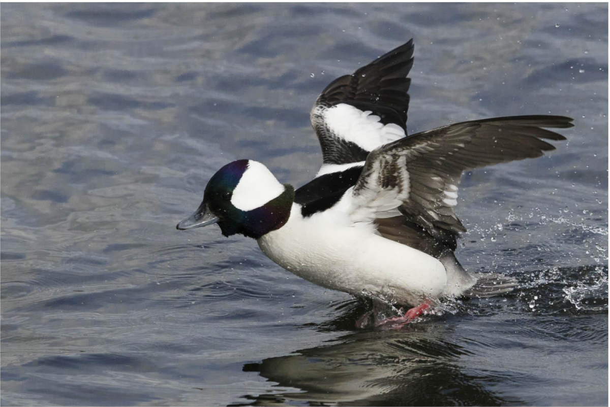
Buffelhead Landing - Steve Lightle