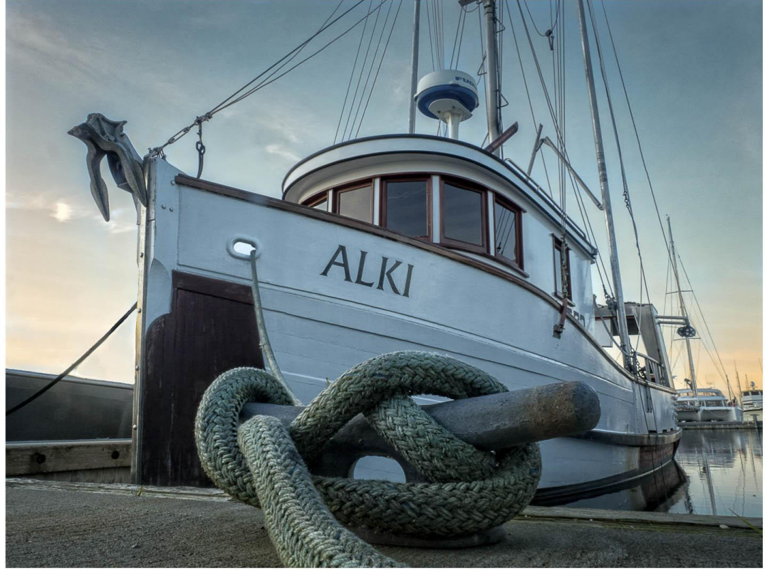
Low Angle Perspective - Greg Thomas