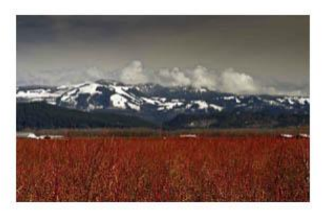
Skagit Valley Blueberry Fields -Sherrie Tallman