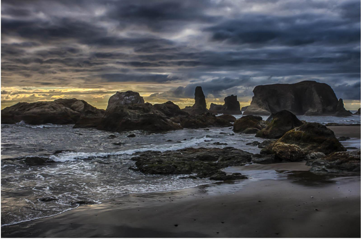
Bandon Beach Sunset - Bill Schwarz