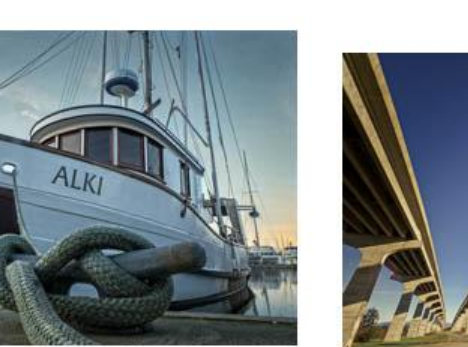
Low Angle Perspective - Greg Thomas