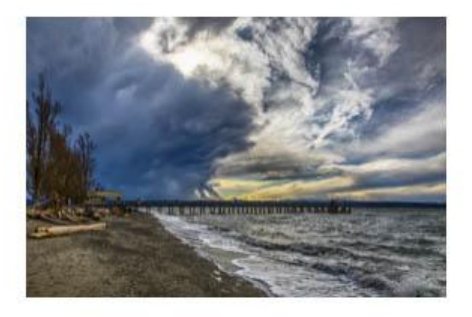
Kayak Point - Bill Schwarz