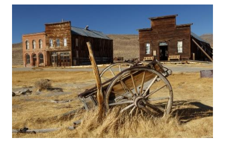
"Bodie Ghost Town"