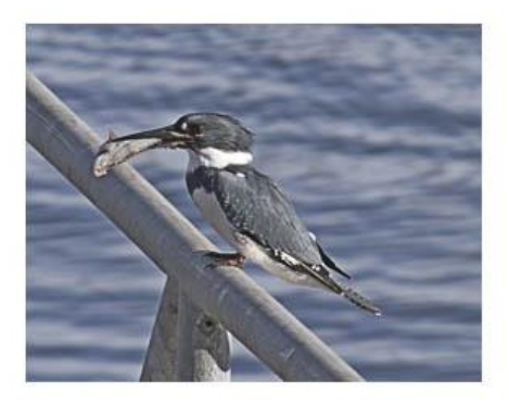
KINGFISHER 1-JIM BASINGER