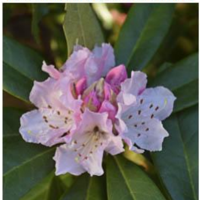
First Rhody at Snoqualmie Falls - Son