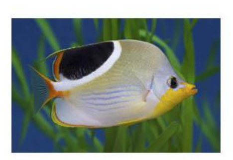
Tropical Fish - Renata Kleinert