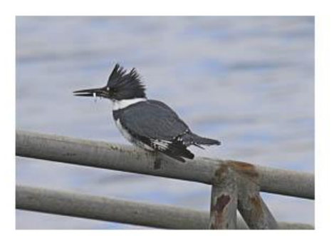
KINGFISHER 2-JIM BASINGER