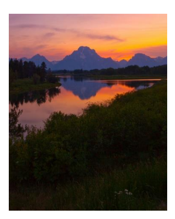
"Sunset At Oxbow Bend"