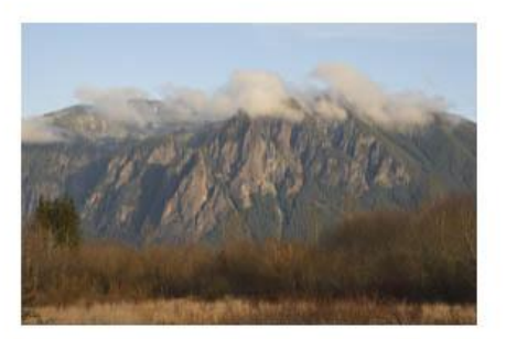
Mt Si 3 at Snoqualmie - Sonia Rahm