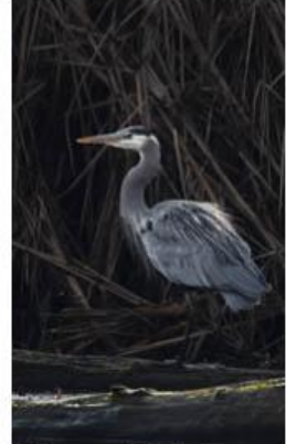
Heron - Bill Schwarz