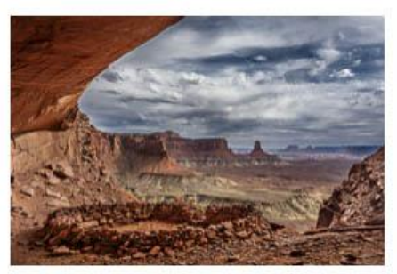
False Kiva - Bill Schwarz