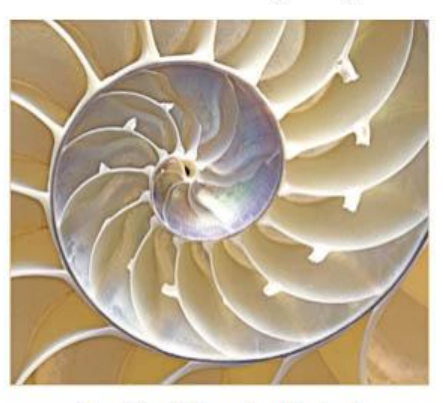
Sea Shell-Renata Kleinert