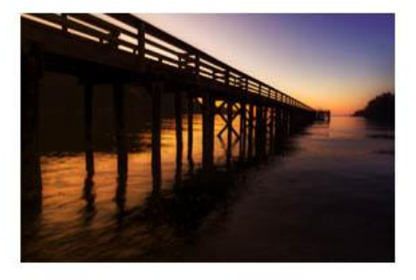
Bowman Bay Sunset Dock - Sonya L