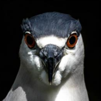
Black Crowned Night Heron - Steve Li