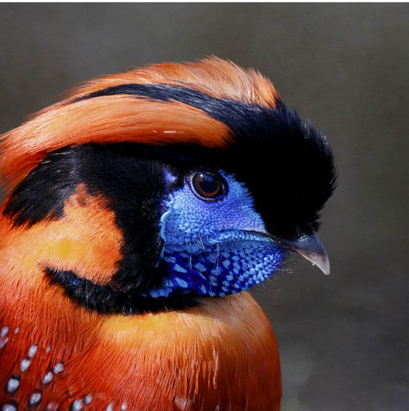
Temminick's Tragopan