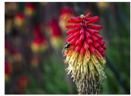
Indian Paint Brush and a Bee - Greg