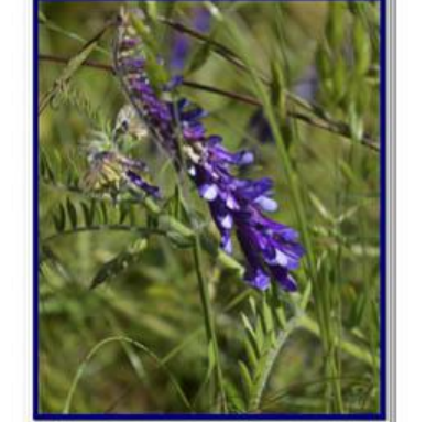
Purple Wildflower - Sonia Rahm