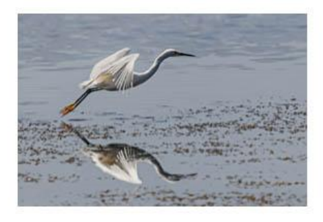
Snowy Egret In Flight - Steve Lightle