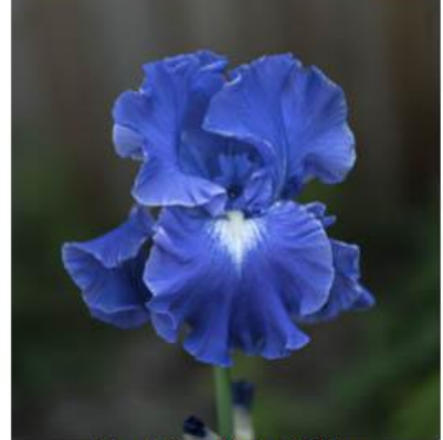
Blue Iris- Paula Kelley