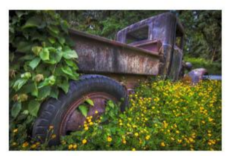
Garden Ford-sonya lang