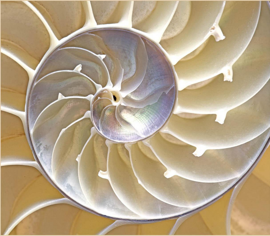
Sea Shell-Renata Kleinert