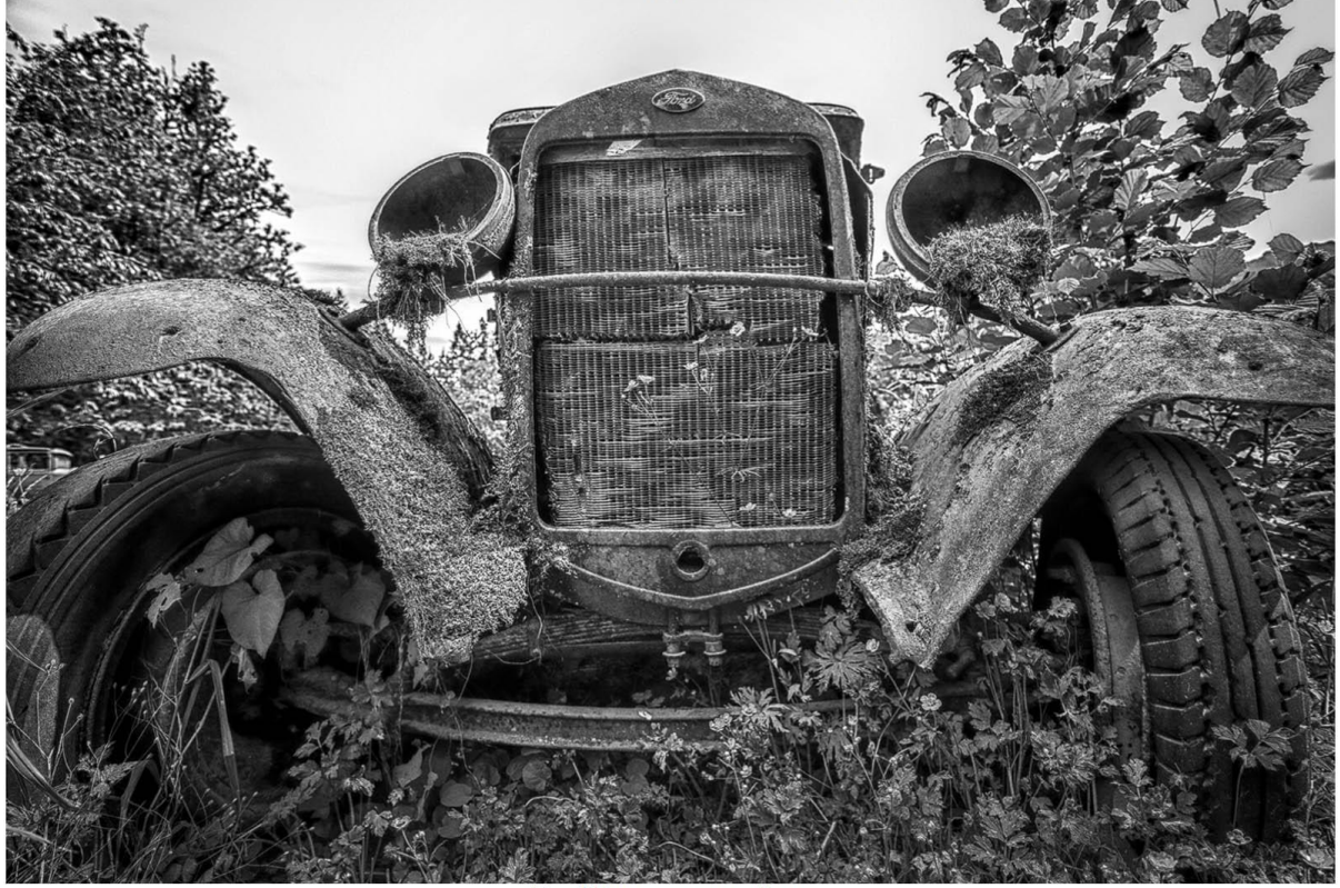
Ford Power-sonya lang