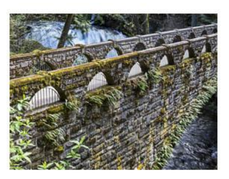
Whatcom Falls Bridge - Bill Schwarz