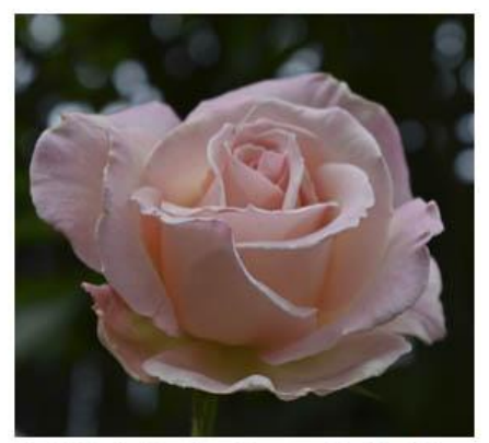
Soft Pink Climing Rose - Sonia Rahm