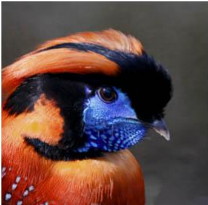
Temminick's Tragopan