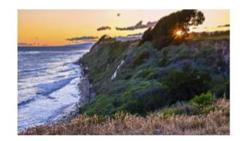
Elwood Bluffs Sunflare - Jennie Boum