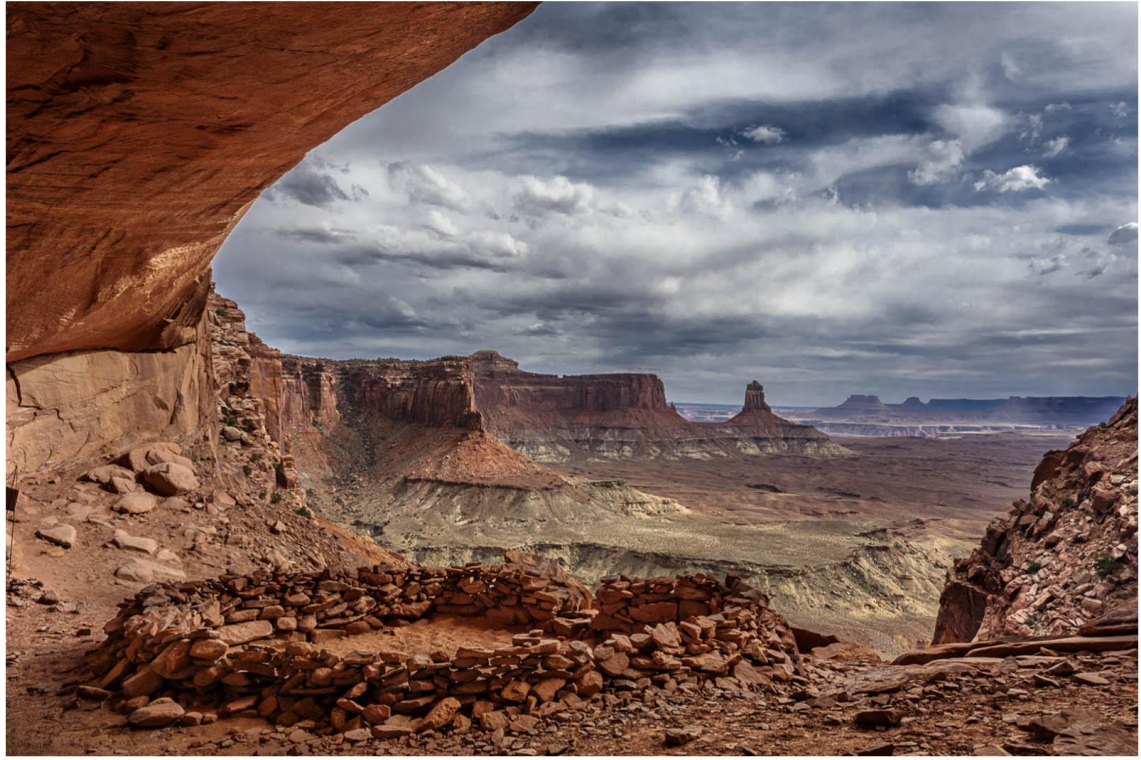
False Kiva - Bill Schwarz