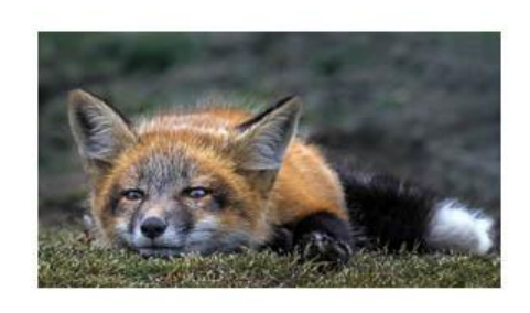
Oh Bother-Lee dygert