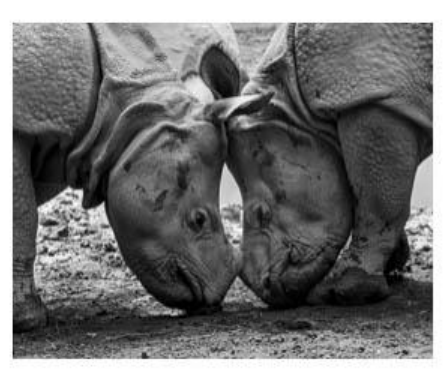
When Push Comes To Shove - Steve Lightle