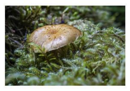
Mushroom Macro