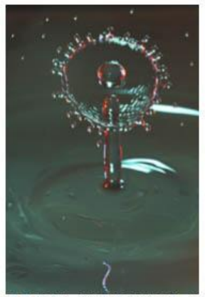
DROP 1-JIM BASINGER