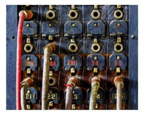
Switchboard - Steve Lightle