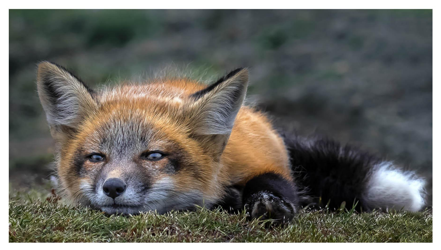
Oh Bother-Lee dygert