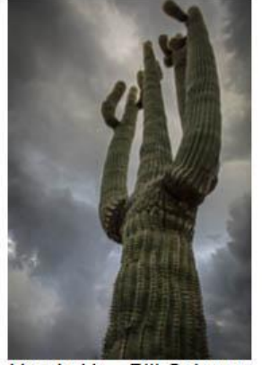
Hands Up - Bill Schwarz