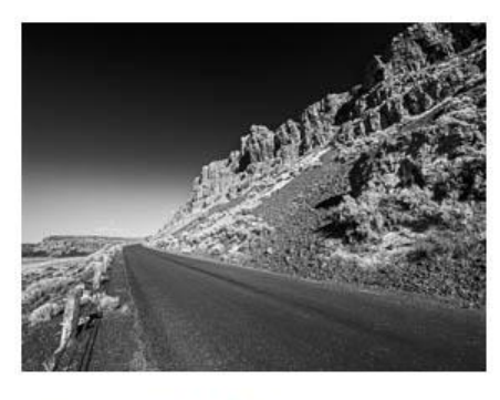
Vantage Road Cliffs reg images -Greg Thomas