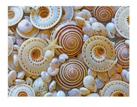
Shell Patterns - Renata Kleinert