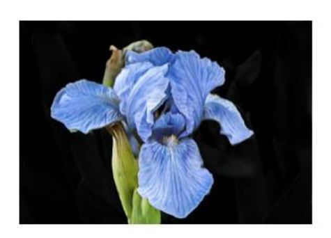
Dwarf Blue Iris reg images - Greg Thomas