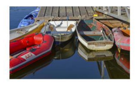
Dinghies at Dock - Jennie Bouma