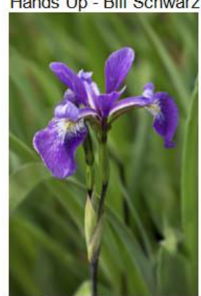
Iris - Bill Schwarz