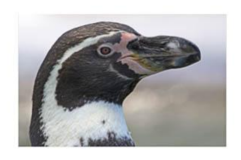
Humboldt Penquin - Renata Kleinert