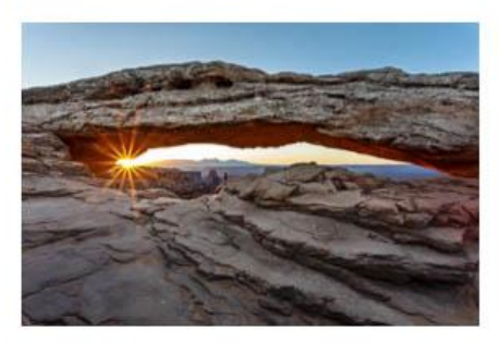
Mesa Arch Sun Burst - Bill Schwarz