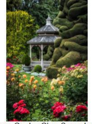
Rose Garden Glow-Sonya Lang