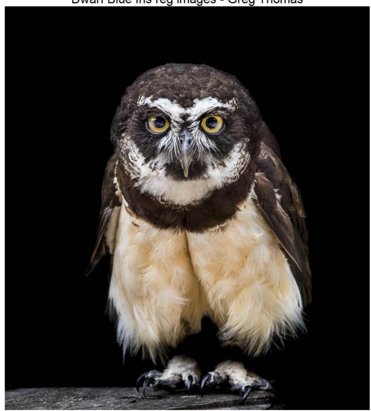
Spectacled Owl - Paul Priebe

Dwarf Blue Iris reg images - Greg Thomas