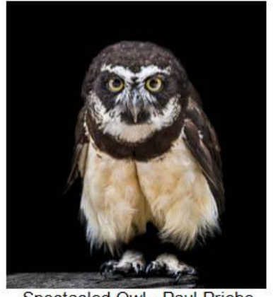
Spectacled Owl - Paul Priebe