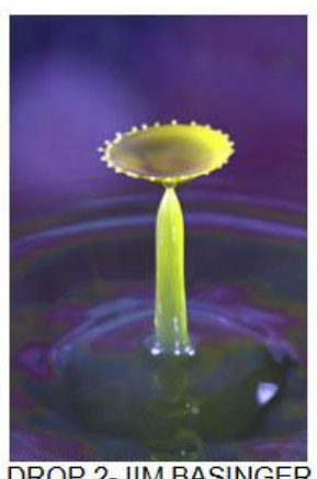
DROP 2-JIM BASINGER