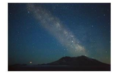
Mt St Helens Milky Way