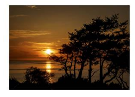
Fort Casey Sunset reg images - Greg Thomas