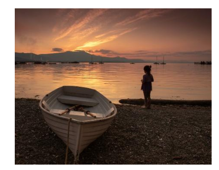
"Vesuvius Bay"