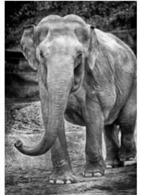
Gorgeous Old Girl-Sonya Lang