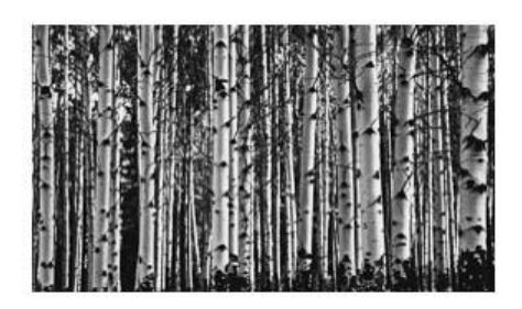
Aspen - Bill Schwarz