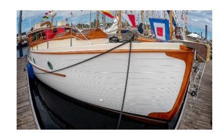
"Your Ship Awaits" © Greg Thomas