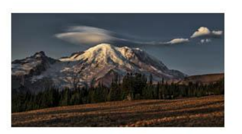
Last Morning-Lee Dygert