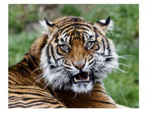
Kirana, Sumatran Tiger