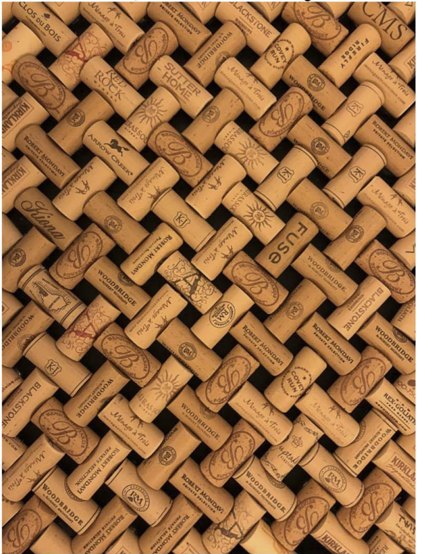
Corks - Dell Deierling