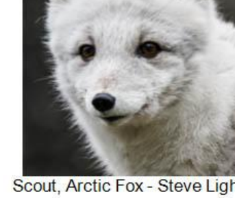
Scout, Arctic Fox - Steve Lightle