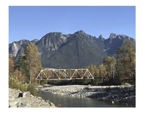
Train Trestle at Index - Sonia Rahm