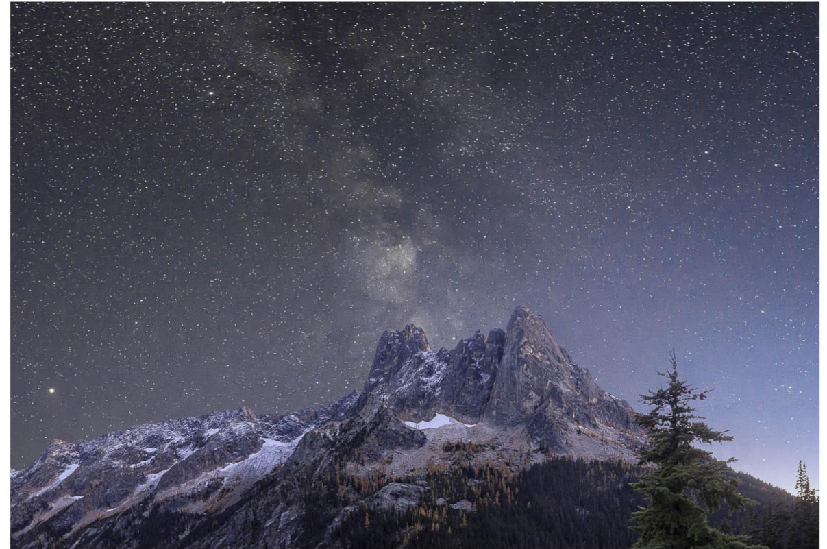
Liberty Bell 1 - Doug Goodman.jpg