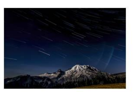
Shock Wave-Lee Dygert