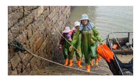
"Seaweed Harvesters"