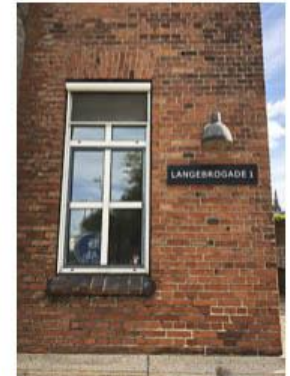
Copenhagen street - Patricia Garrison