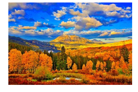
"Keibler Pass"