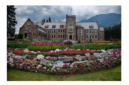
"Banff Cascade Gardens"