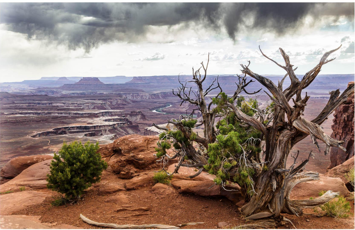
Green River Overlook - Bill Schwarz