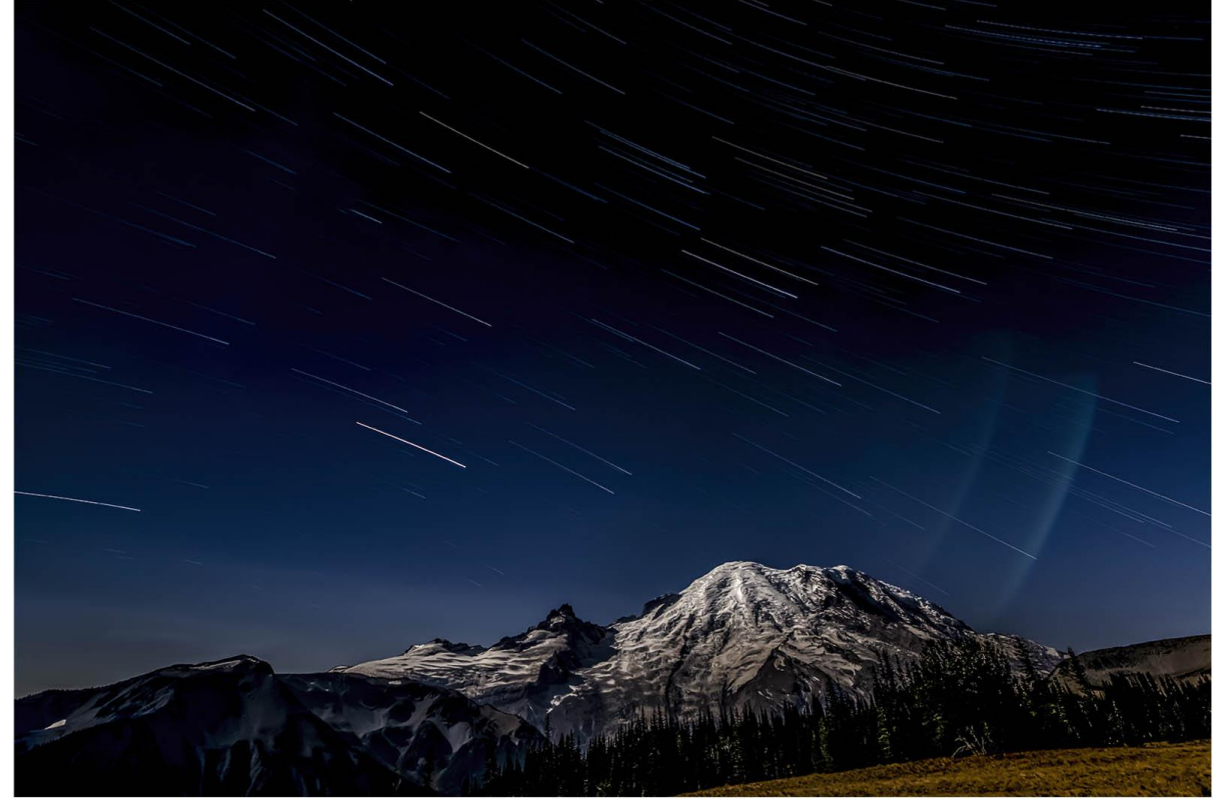
Shock Wave-Lee Dygert