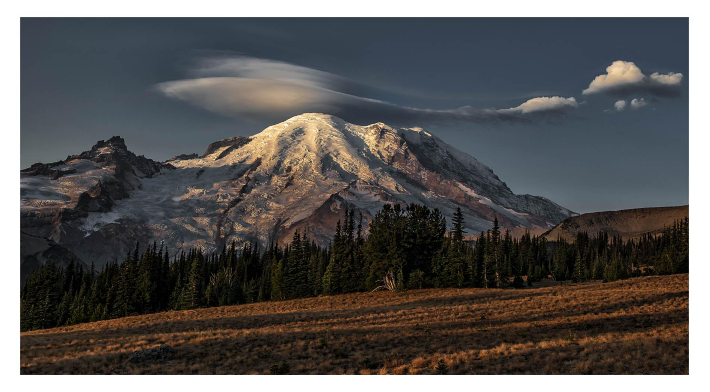
Last Morning-Lee Dygert