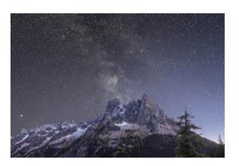
Liberty Bell 1 - Doug Goodman.jpg