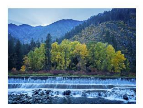
Wenatchee River Damn with Fall Col