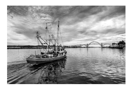
"Kylie Lynn Newport Oregon"