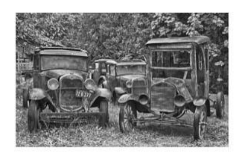
20 Old Timers - Renata Kleinert