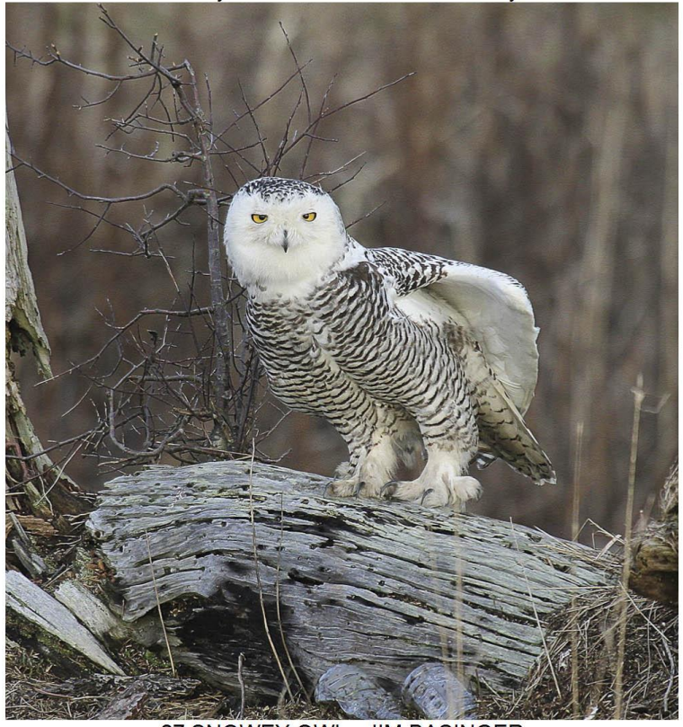
27 SNOWEY OWL - JIM BASINGER