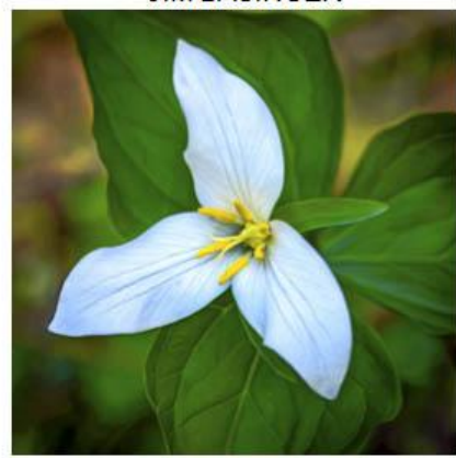
30 Trilium - Bill Schwarz