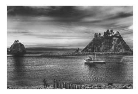
1 1st Beach Boat - Bill Schwarz