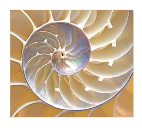
"Sea Shell" © Renata Kleinert