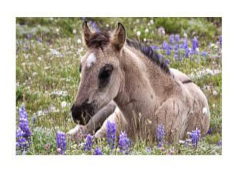
12 Pryor Mountain Foal - Sharon Ely