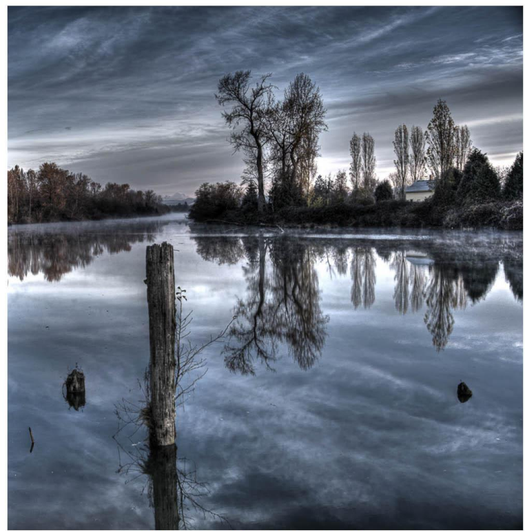
21 Rotary park 1 - Doug Goodman