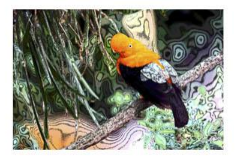
99 2 Bird Art - Donna Branscome