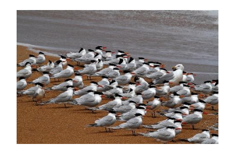
"Royal Terns And One Seagull"