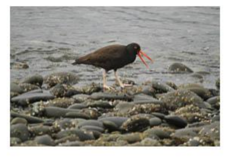
99 3 BLACK ORYSTER CATCHER M