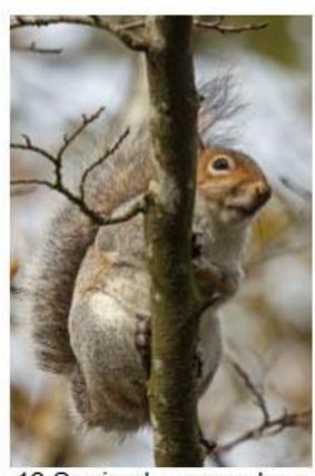
13 Squirrel - sonya lang