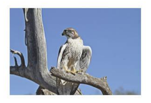
99 4 PEREGRINE FALCON MAKEU