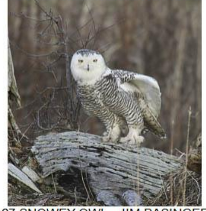
27 SNOWEY OWL - JIM BASINGER