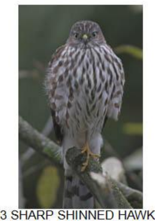
99 13 SHARP SHINNED HAWK MAK