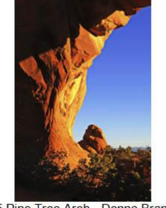
99 5 Pine Tree Arch - Donna Bransco