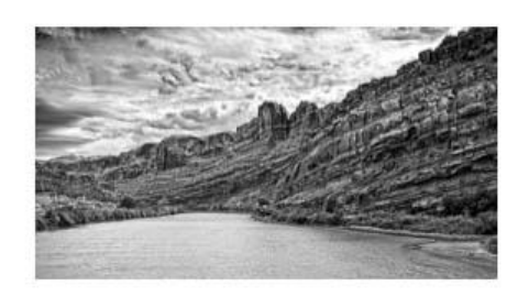
8 Colorado River - Sonya Lang