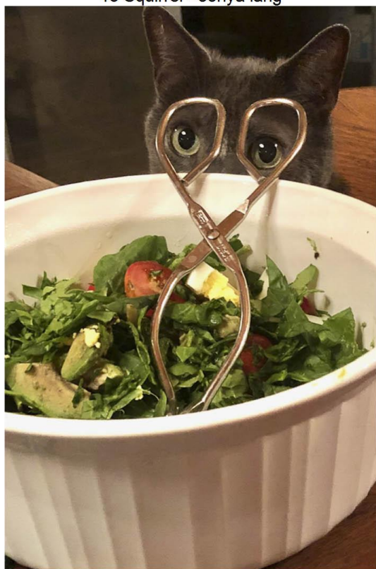
9 Eye Spy - Dell Deierling