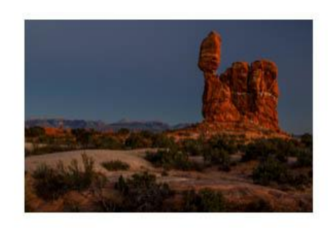
14 Balanced Rock At Sunset - Steve