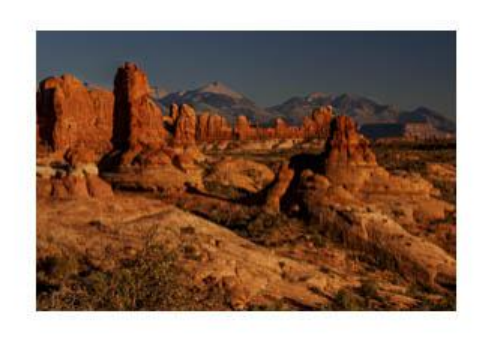
23 Garden Of Eden - Steve Lightle