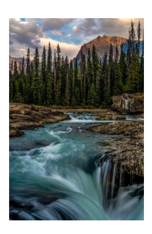
"The Falls"