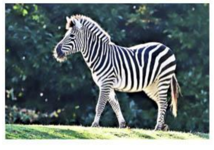
99 19 Stripes - Donna Branscome