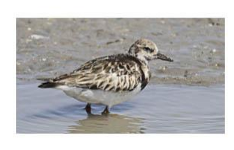
99 6 RUBY TURNSTONE MAKEUP -JIM BASINGER