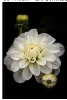
22 Three in White - Sonya Lang