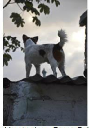
7 Climbing to view - Renee Deierling