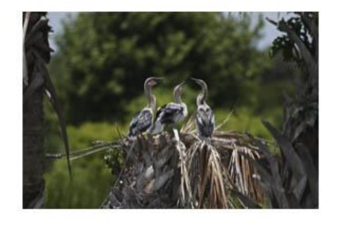
4 ANHINGAS - JIM BASINGER