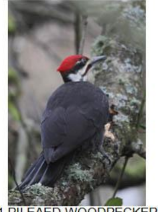
99 11 PILEAED WOODPECKER MA