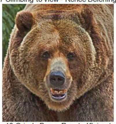
10 Grizzly Bear - Renata Kleinert