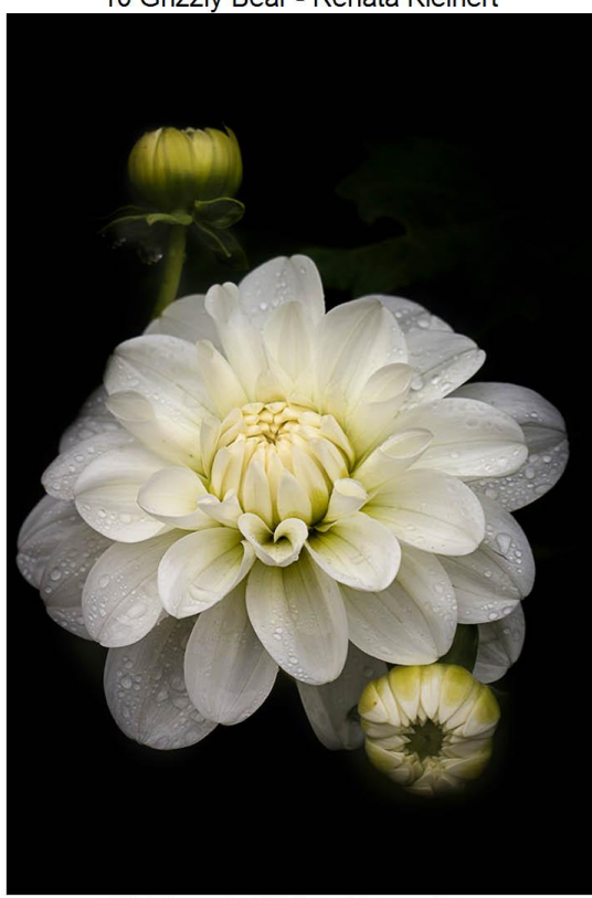
22 Three in White - Sonya Lang