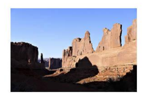
99 12 Shadom - Donna Branscome