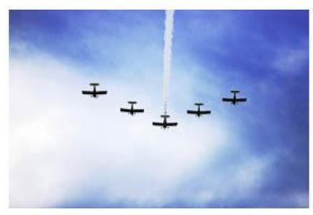
99 14 The Flying V - Donna Bransco