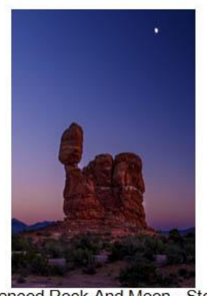
5 Balanced Rock And Moon