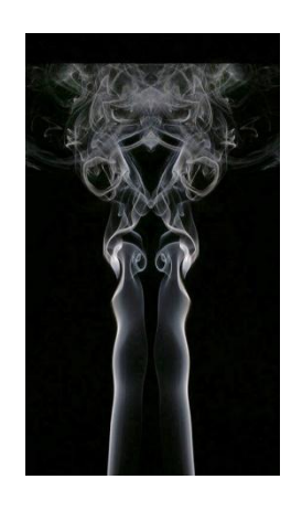
"I Am Your Father" © Jim Basinger