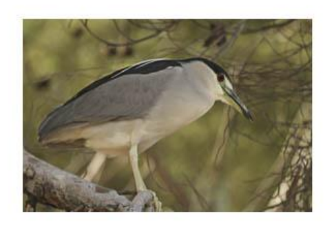
99 15 BLACK CROWNED NIGHT HERON MAKEUP - JIM BASINGER