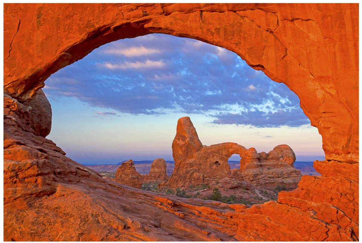
29 The Winndow and Turret Arch - Renata Kleinert