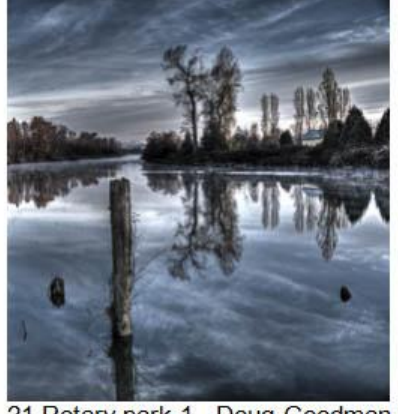
21 Rotary park 1 - Doug Goodman