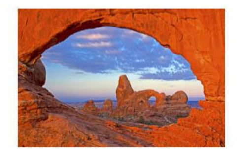
29 The Winndow and Turret Arch -Renata Kleinert