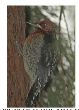
99 18 RED BREASTED SAPSUCKER MAKEUP - JIM BASINGER