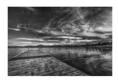
16 Dock of the Bay - Bill Schwarz