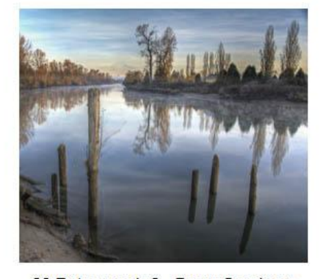
26 Rotary park 2 - Doug Goodman