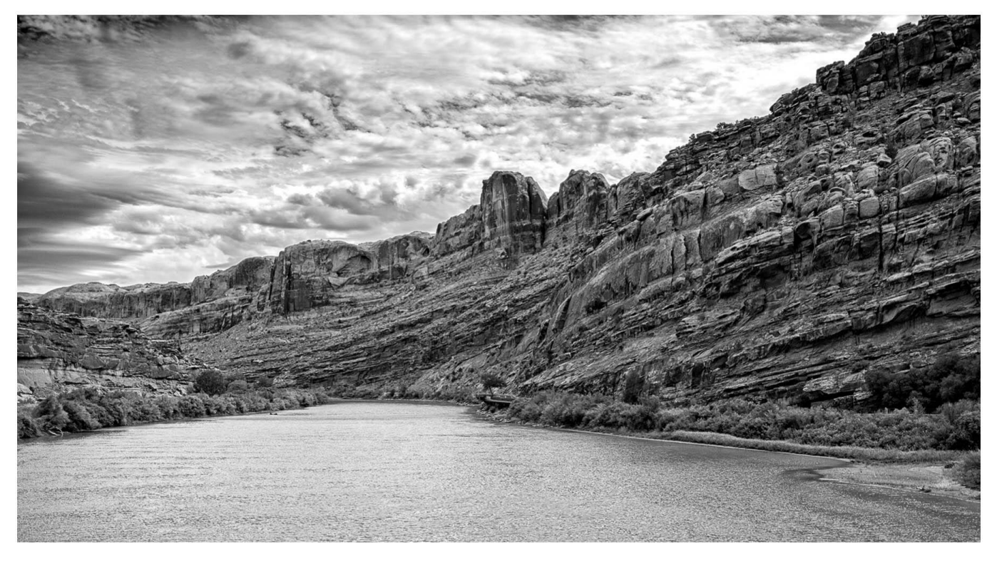
8 Colorado River - Sonya Lang