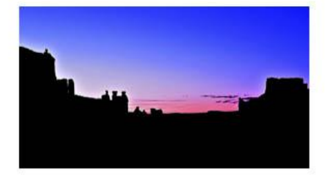
2 3 Wise Men - Donna Branscome