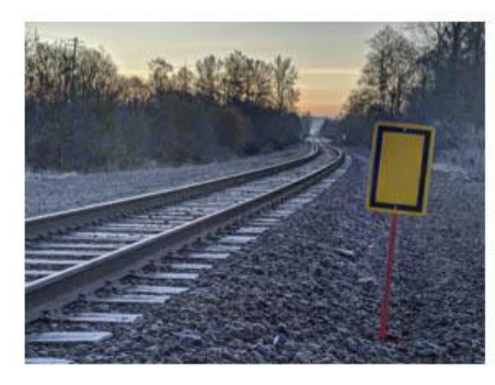
3 AM train tracks - Doug Goodman