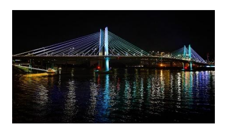
"Tillikum Crossing Bridge"