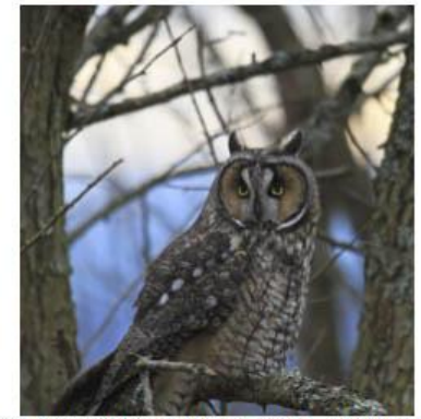
99 16 LONG EARED OWL MAKEUP - JIM BASINGER