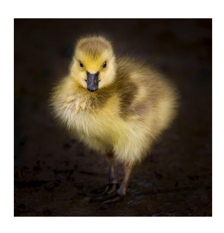
"Wild fluffy Gosling"