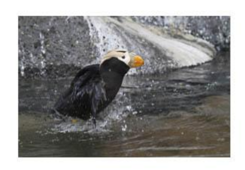
99 20 TUFFED PUFFIN MAKEUP - JI