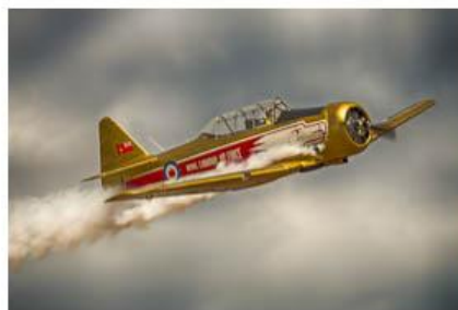
Solitary Flight-Sonya Lang