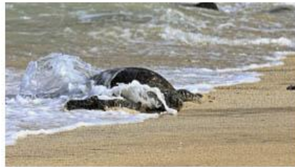
Green Sea Turtle-Donna Branscome