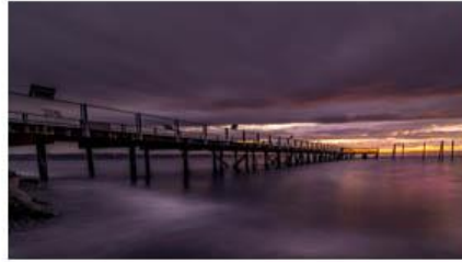
Kayak Point At Blue Hour