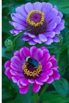
Zinnia Flowers - Renata Kleinert