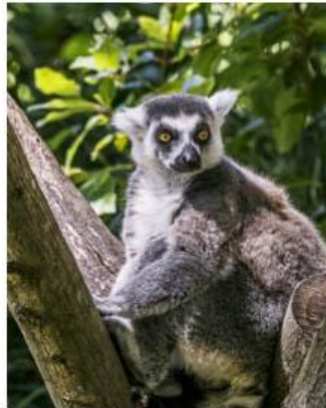
Ring tailed Lemur