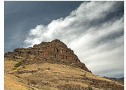
fire on the mountain - Tim Garton