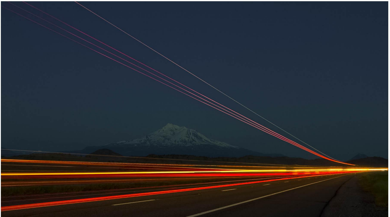
Light Trails and Shasta - Sherrie Tallman