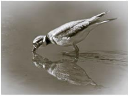
Killdeer - Bill Schwarz