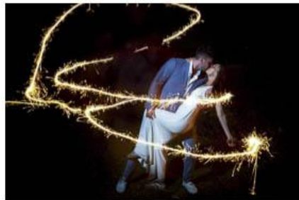
Sparklers - Ron Raport