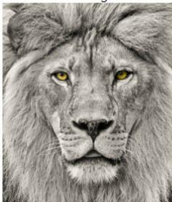
Xerxes In B&W - Steve Lightle