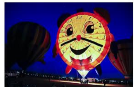
Let's Be Happy-Donna Branscome