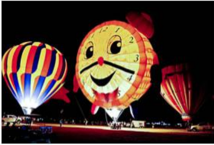
Hot Summer Nights-Donna Branscom