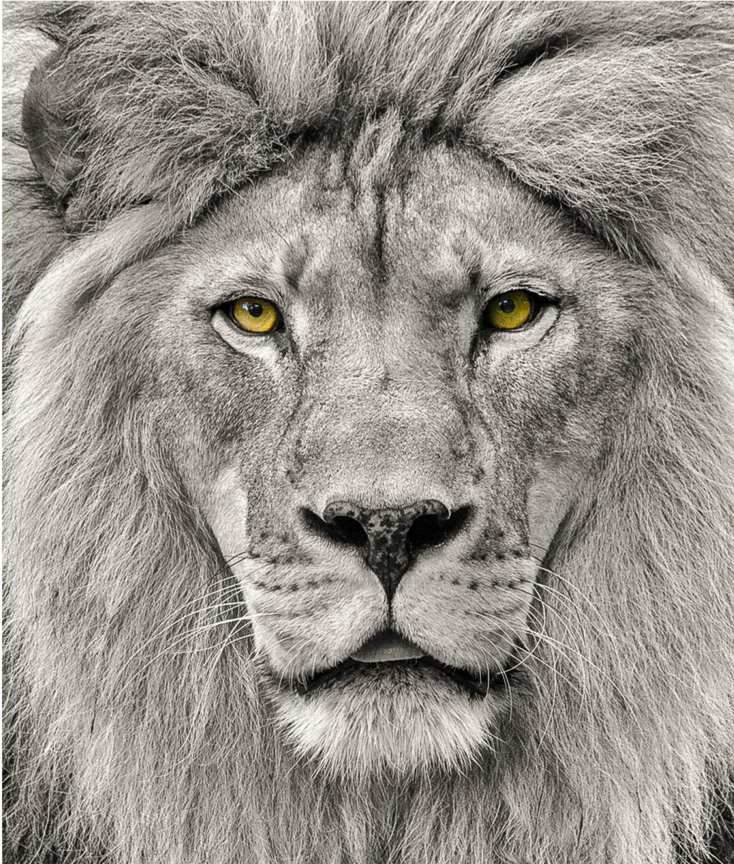
Xerxes In B&W - Steve Lightle