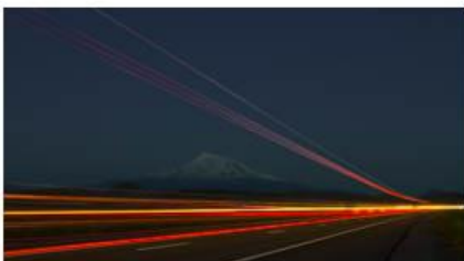
Light Trails and Shasta - Sherrie Tallman