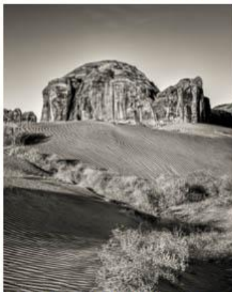
Sunrise Monument Valley Dunes - Pa