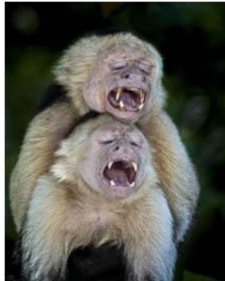
Cry Babies - Paul Priebe