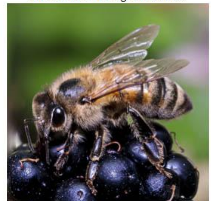
Bee on Berry - Bill Schwarz