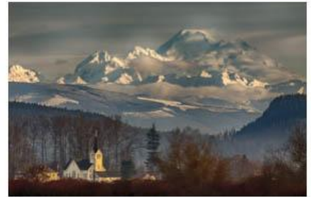
Mt Baker with Church - Bill Schwarz