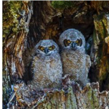
2013_02_15 Nisqually Great Horned Owls IMG_5612-Edit