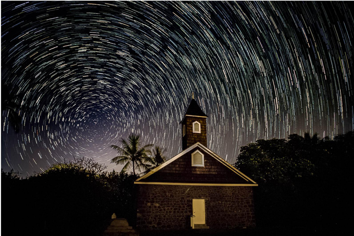
Keawala'i Congregational Church & Stars - Ron Raport