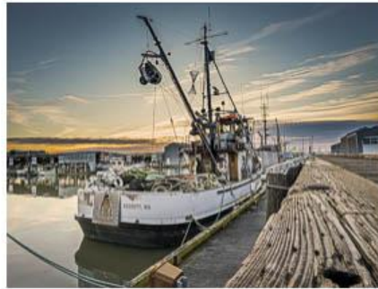
Working Boat - Doug Goodman