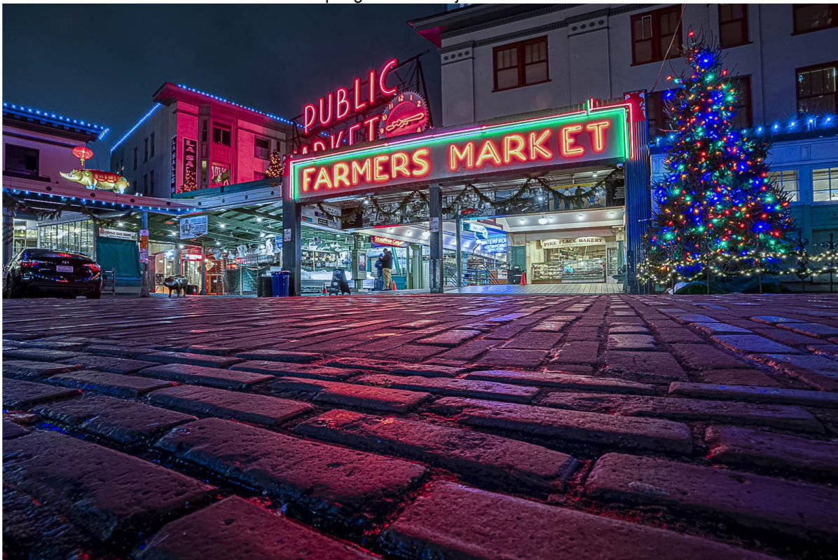
PP Market - Doug Goodman