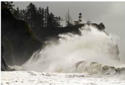
Cape Disappointment - Renat Kleinert