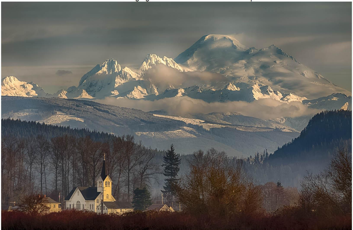
Mt Baker with Church - Bill Schwarz