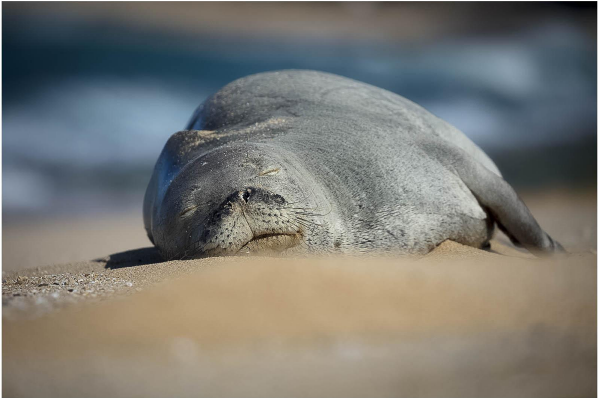
Monk Seal, Ho'okipa