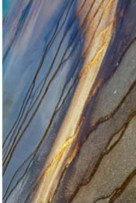
Yellowstone Abstract - Tracy Carson