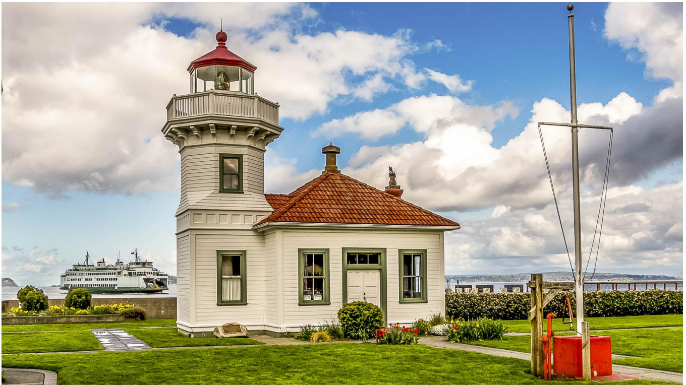
Spring in Mukilteo-juan stout