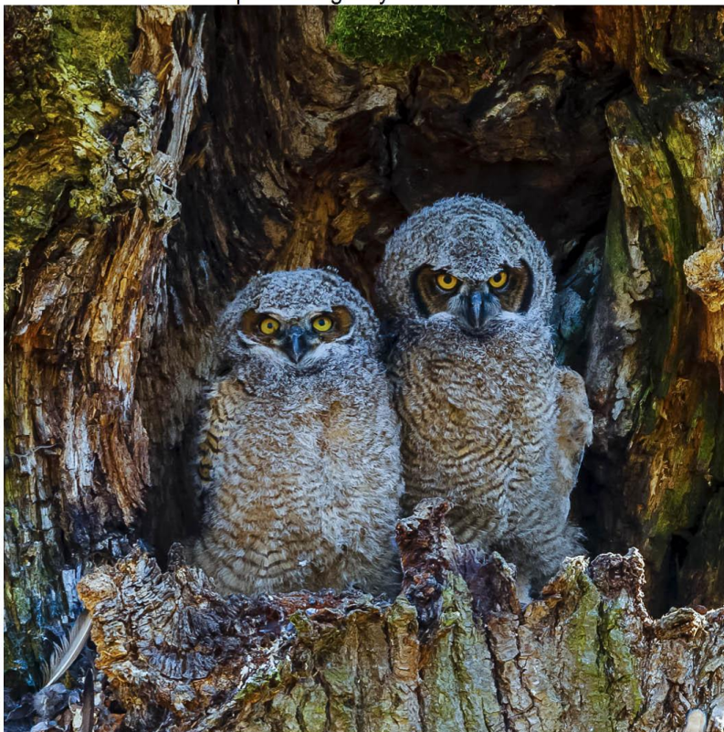
2013_02_15 Nisqually Great Horned Owls IMG_5612-Edit