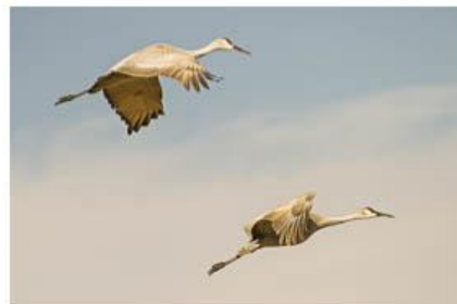
Flight of the Cranes-Sharon Ely