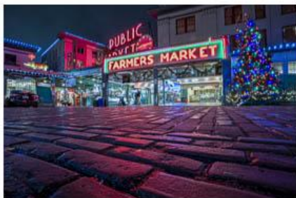
PP Market - Doug Goodman