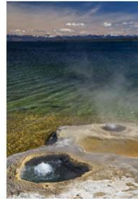
West Thumb Thermals - Tracy Carso