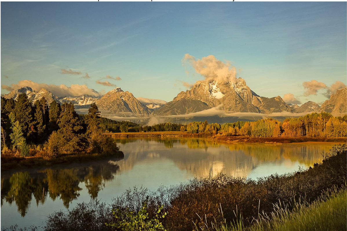
Oxbow Bend - Tracy Carson