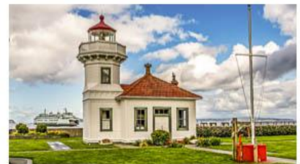
Spring in Mukilteo-juan stout