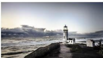
Path To The Watch Tower - Juan stout