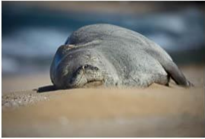
Monk Seal, Ho'okipa