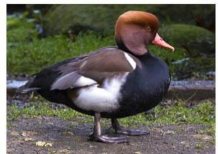
Red Headed Duck - Renata Kleinert