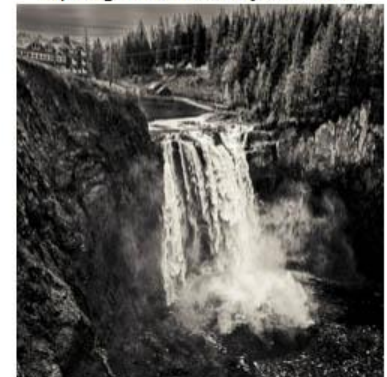
Snoqualmie Falls in Splendid Black and White - juan Stout