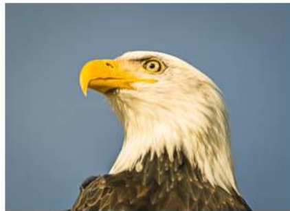
Eagle in Skagit-Paula Kelley