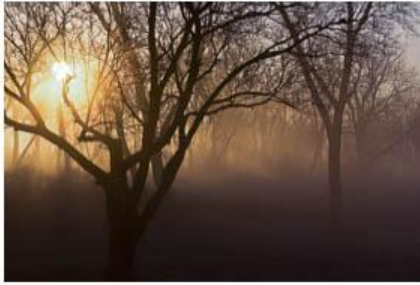
Foggy Sunrise - Bill Schwarz