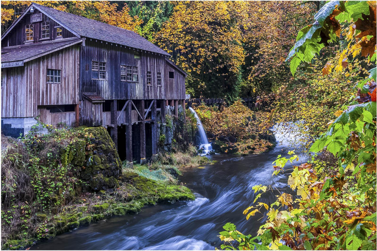
Grist Mill In Fall