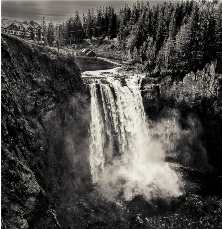
Snoqualmie Falls in Splendid Black and White - juan Stout