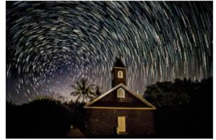
Keawala'i Congregational Church & S