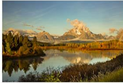
Oxbow Bend - Tracy Carson