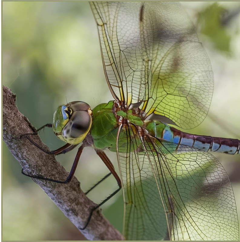
Emperor Dragonfly - Bill Schwarz