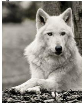
Grey Wolf in B&W - Steve Lightle