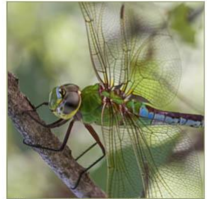
Emperor Dragonfly - Bill Schwarz