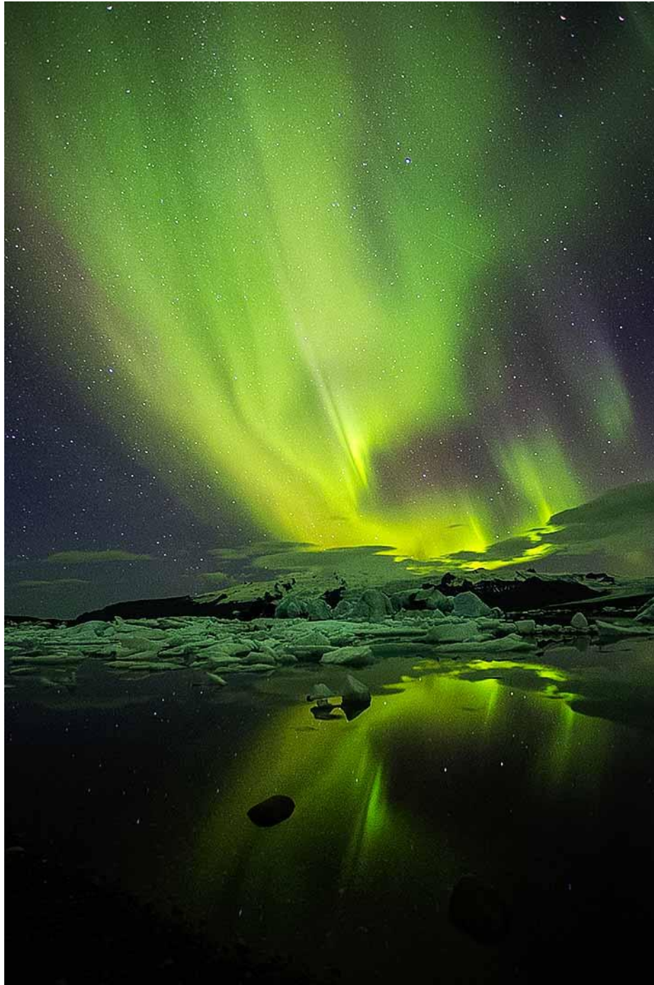
Cover Image: Aurora – Sharon Ely

All images in the newsletter are property of the photographer and all rights are reserved.