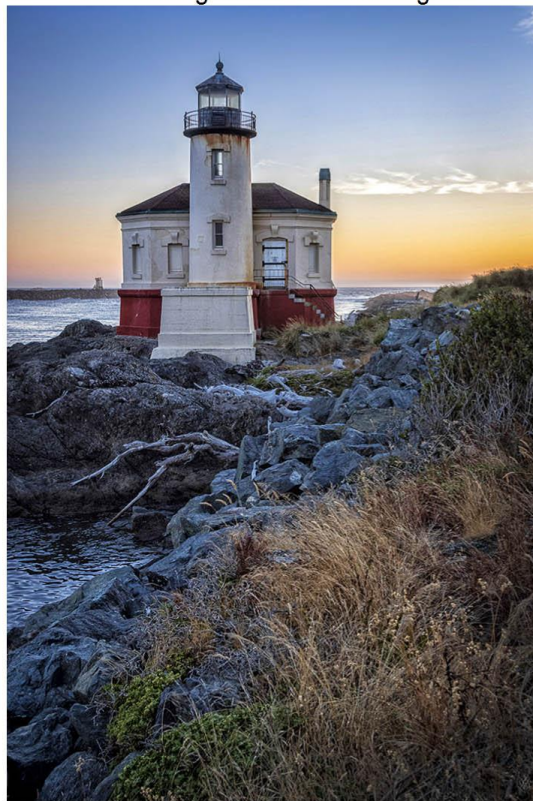
4 Coquille Lighthouse Bandon OR4 - Sonya Lang