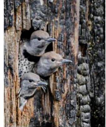
6 Flicker Trio - Steve Lightle