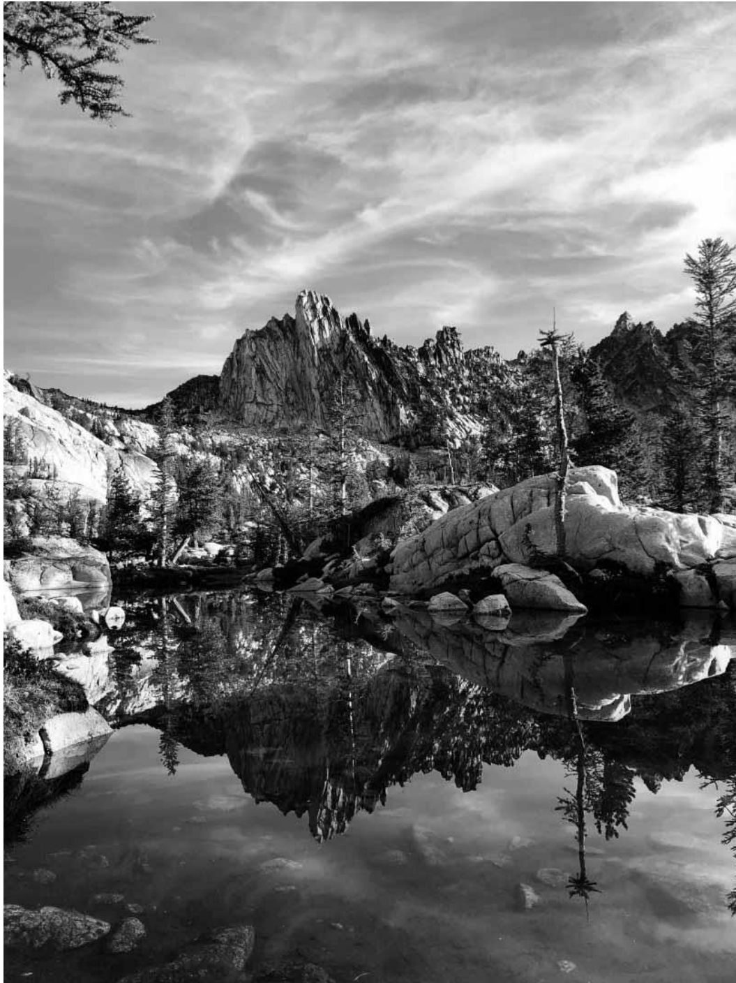
Cover Image: Prusik Peak Reflection - Dell Deierling

All images in the newsletter are property of the photographer and all rights are reserved.