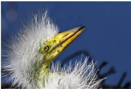
16 Snow Egret Chick - Steve Lightle