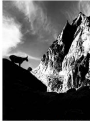
2 Aasgard Goat - Dell Deierling