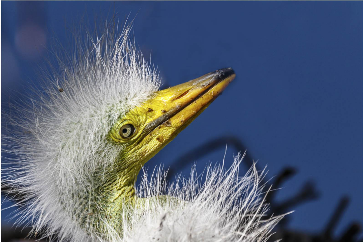
16 Snow Egret Chick - Steve Lightle