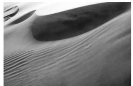
12 Sandscape - Tracy Carson