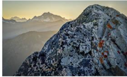
2 A7303616HDEdit - Doug Goodma