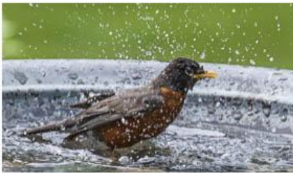
19 Robin Bath - Bill Schwarz