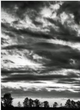
7 Sunset With Clouds - Renata Kleinert