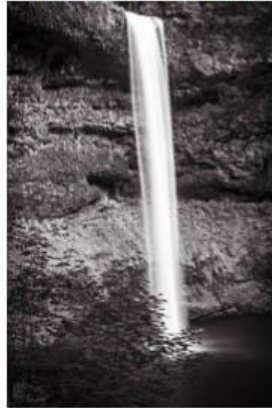
17 Silver Falls - Tracy Carson