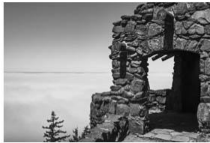
5 Rock Shelter - Tracy Carson