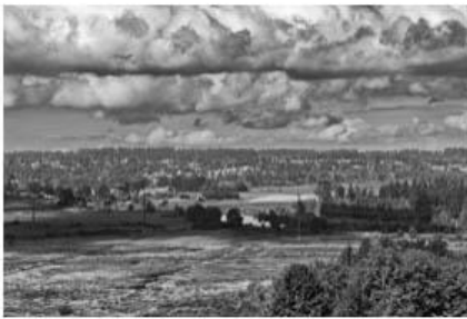
4 Deadwater Slough - Bill Schwarz