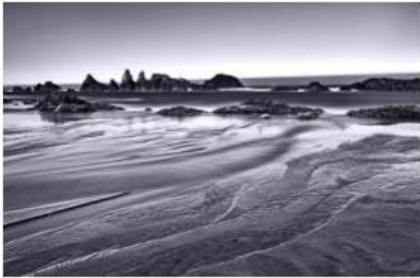
16 Seal Rock Beach - Sonya Lang