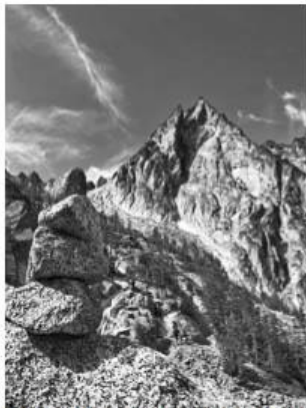
10 Dragontail Peak - Dell Deierling