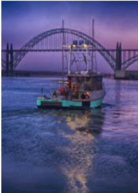
22 The Sea Chase Heading Out - Renata Kleinert