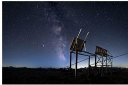
17 A7303750Pano - Doug Goodman