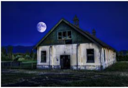
1 A Barn and The Moon - Juan Stout