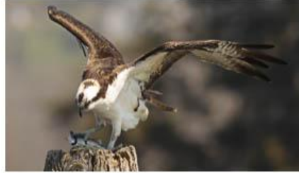
14 Osprey 2 - Bill Schwarz