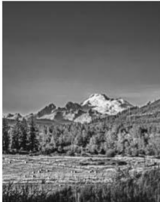
19 Where A Mountain Meets The Sky