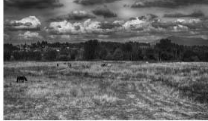
14 Field - Bill Schwarz