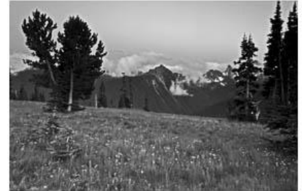
18 Sunrise Flowers - Sherrie Tallman