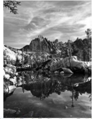
15 Prusik Peak Reflection - Dell Deier