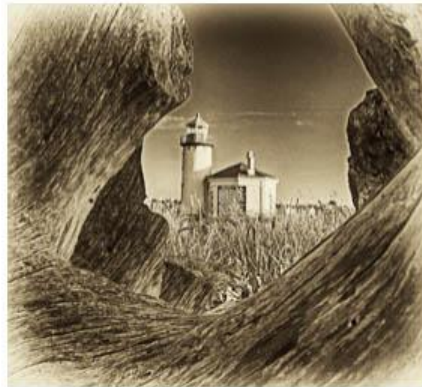
5 Coquille River Light House - Renata