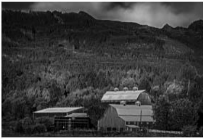
1 A Farm In The Trees - Juan Stout