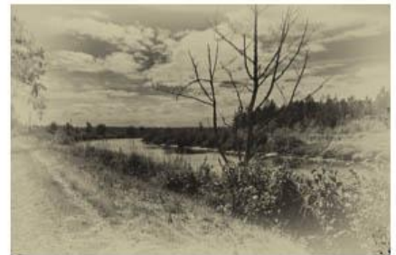
9 Deadwater Slough 2 - Bill Schwarz