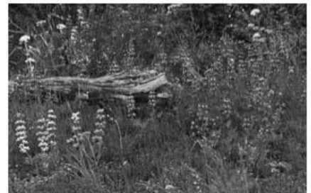
6 Silver Forest Trail - Sherrie Tallman