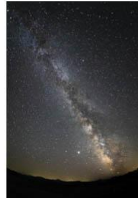
9 A7303707 - Doug Goodman