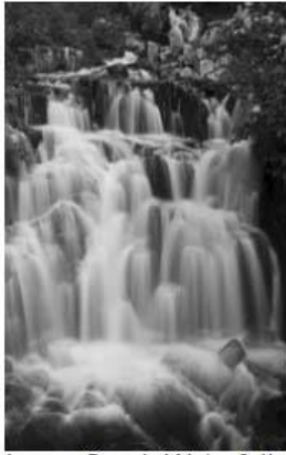
13 Sunbeam Creek Waterfall - Sherri