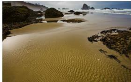
8 Low Tide Beach - Bill Schwarz