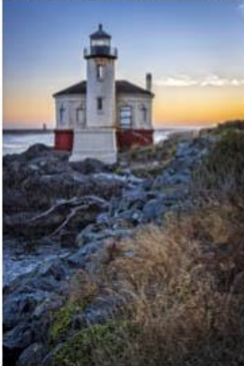
4 Coquille Lighthouse Bandon OR4 -