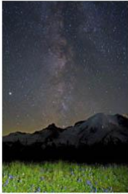
13 Milky Way Over Mt. Rainier - Sherrie Tallman