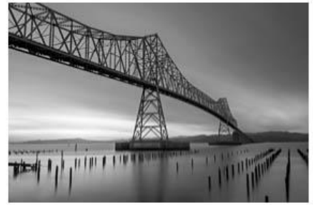
3 Astoria Megler Bridge - Sonya Lang