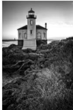
8 Coquille Lighthouse Bandon OR - Sonya Lang