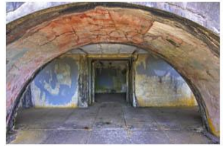
3 Battery Russell - Tracy Carson