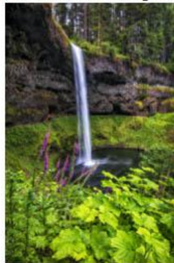
20 South Falls at Silverfalls - Sonya Lang