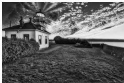
11 Mukilteo Lighthouse With Sunset Clouds _ - Juan Stout