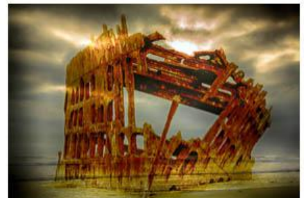
12 Ghost Ship - Renata Kleinert