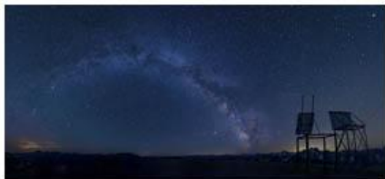
1 A7302943Pano1 - Doug Goodman