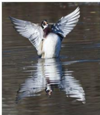
10 Dancing Wood Duck - Bill Schwarz