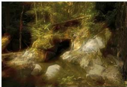
16 Tranquility - Bob Birnbaum