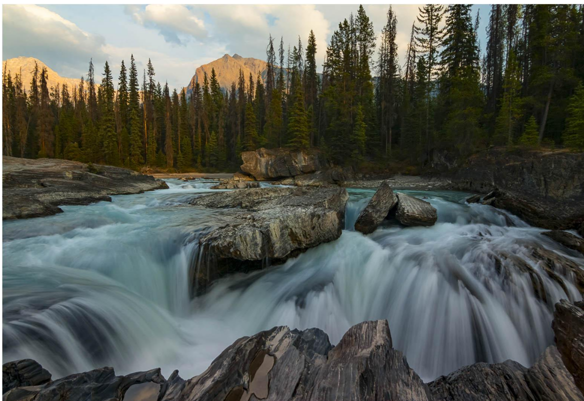
9 Banff - Tracy Carson