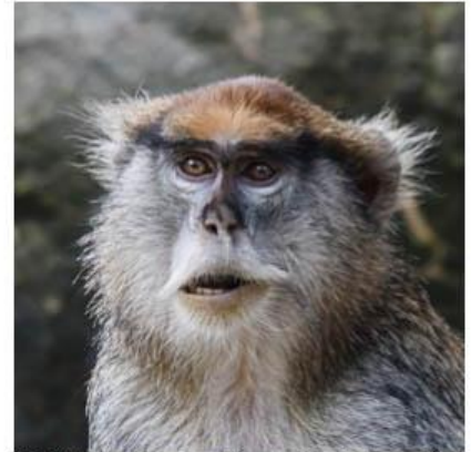
15 Patas Monkey Portrait