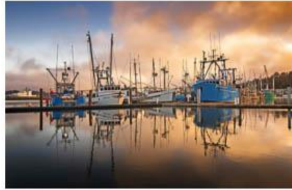
14 Newport Marina Sunset - Sonya L