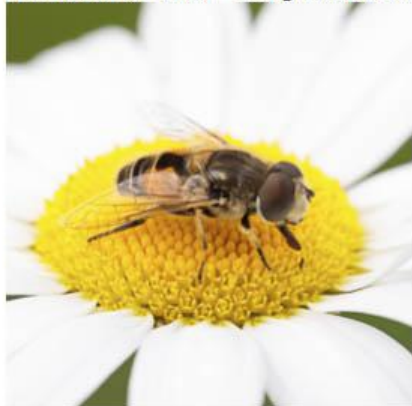
4 Bee Oxeye - Bill Schwarz