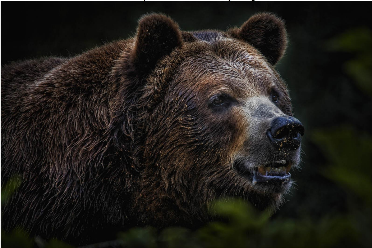
3 Bear 2 - Sonya Lang