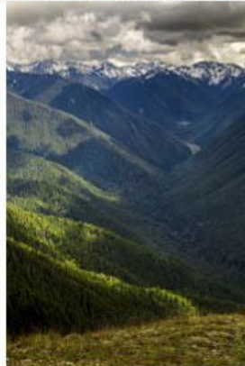
17 Hurricane Ridge - Bill Schwarz