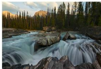
9 Banff - Tracy Carson