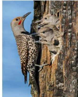
6 Flicker Family - Steve Lightle