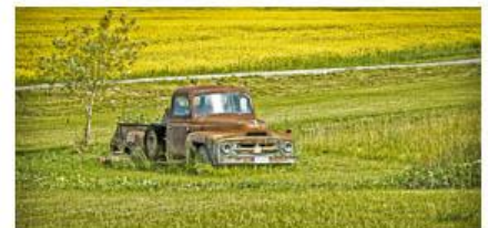
21 Truck and Tree - Sonya Lang