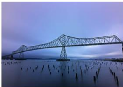
2 Astoria Megler Bridge - Tracy Carson