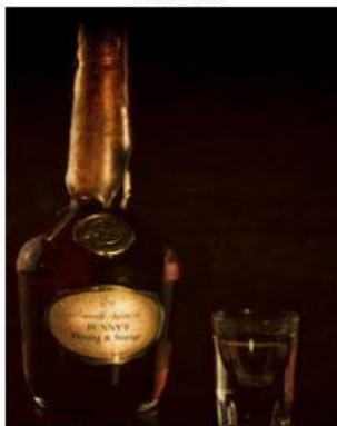
5 Bunny's Moving and Storage - Juan Stout