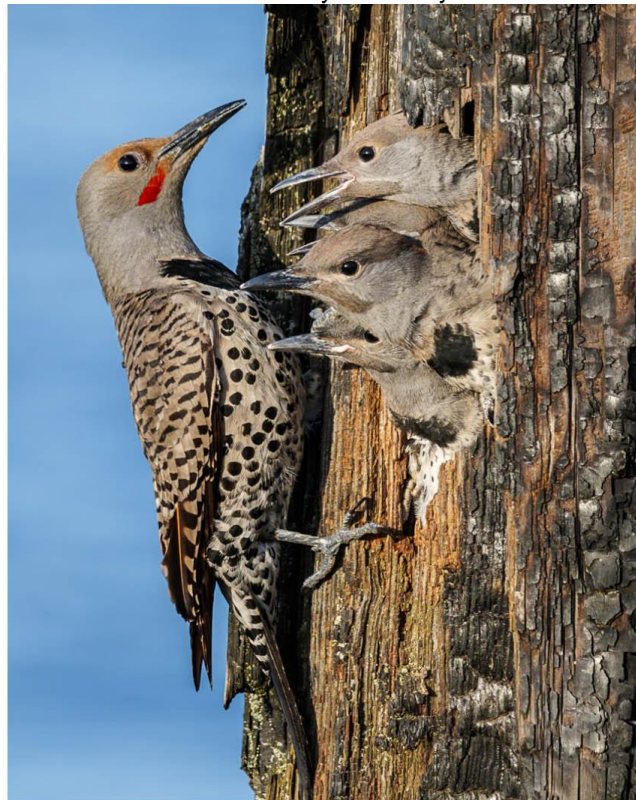
6 Flicker Family - Steve Lightle