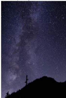
19 Milky Way Over the North Cascad