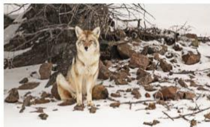
23 Yellowstone Coyote - Tracy Carso