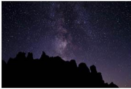
13 Milky Way Over The Feathers - Sh