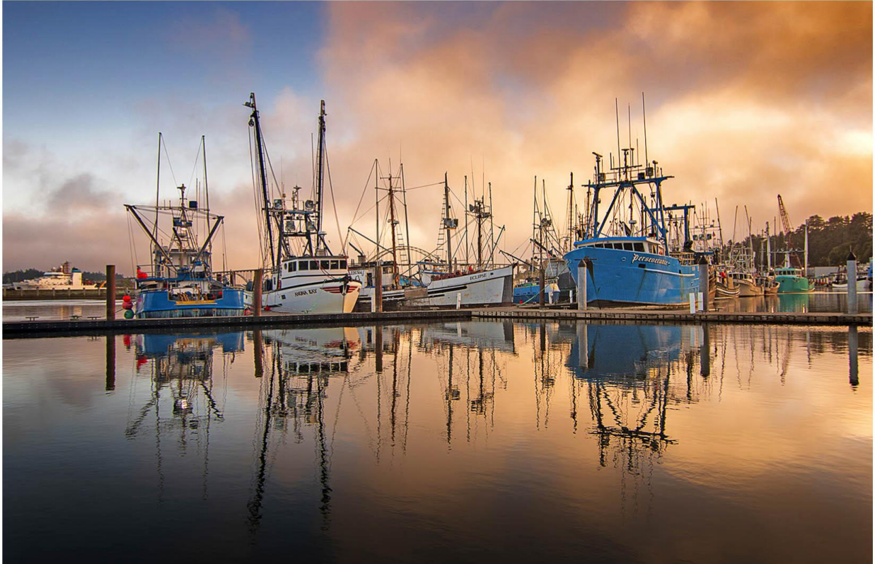
14 Newport Marina Sunset - Sonya Lang