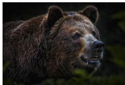
3 Bear 2 - Sonya Lang