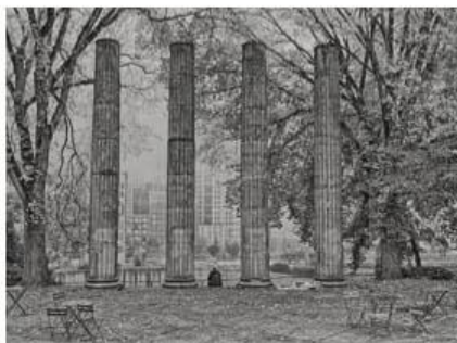
8 Plymouth Pillars - Bob Birnbaum