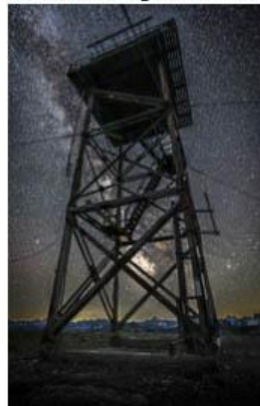
20 Slate Peak tower - Doug Goodma