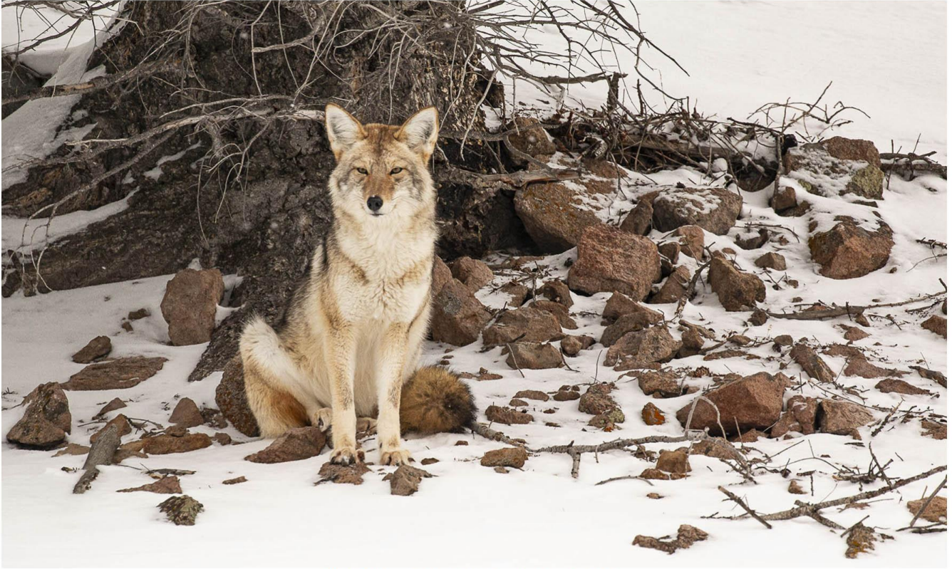
23 Yellowstone Coyote - Tracy Carson