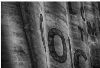
10 Concrete - Bob Birnbaum