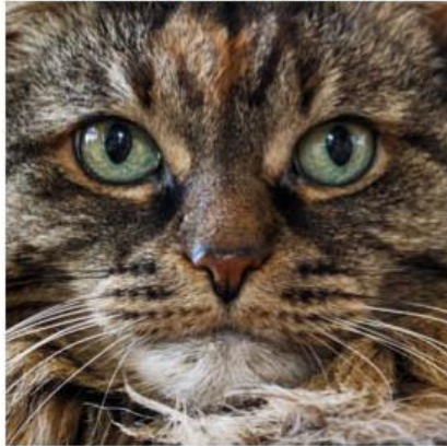
4 Green Eyes 1 - Steve Lightle