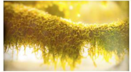
3 Backlit Moss - Juan Stout