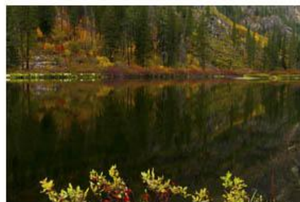
15 Reflections of Greene - Sherrie Tal