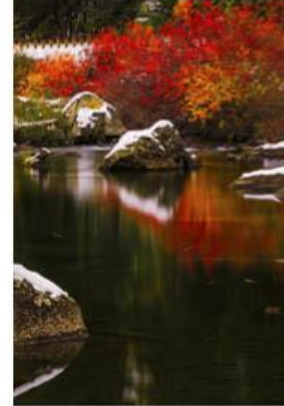
18 Reflection Rock - Juan Stout