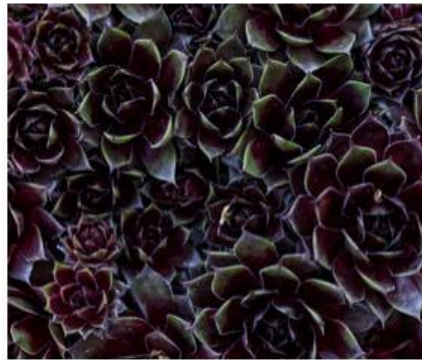
17 Plant - Bill Schwarz