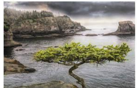
9 Cape Flattery 4 - Bill Schwarz