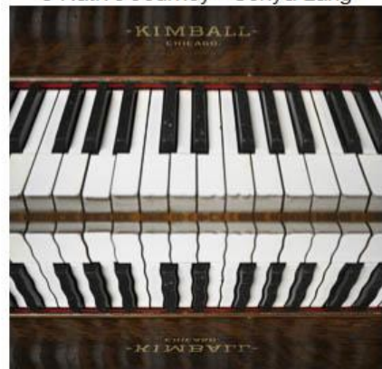
11 Double vision - Renata Kleinert