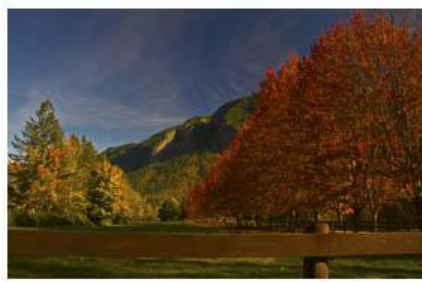
20 The Colors of Fall - Sherrie Tallma