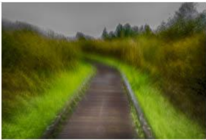
4 Boardwalk - Bob Birnbaum