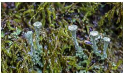
10 Green Moss - Bill Schwarz