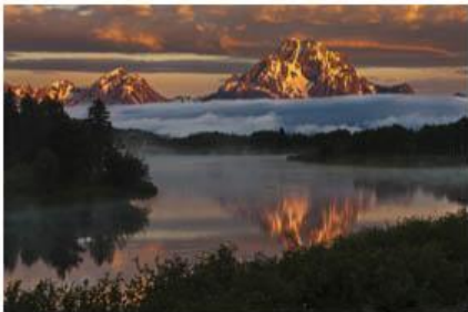
19 Sunrise At Oxbow Bend