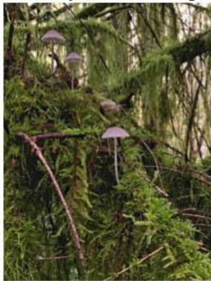
7 On a Limb - Dell Deierling