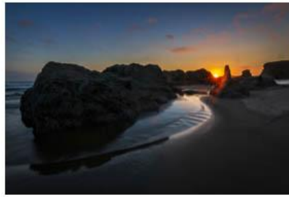
2 Bandon Beach2 - sonya lang