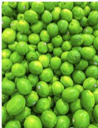
13 Limes - Bill Schwarz