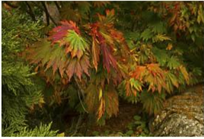
1 An Explosion of Fall Colors - Sherrie Tallman