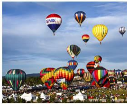
14 Reno Balloon Races - Steve Lightf