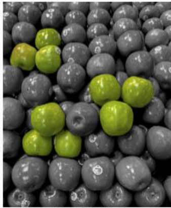
2 Apples - Bill Schwarz