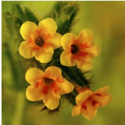
7 Fiddleneck - Steve Lightle