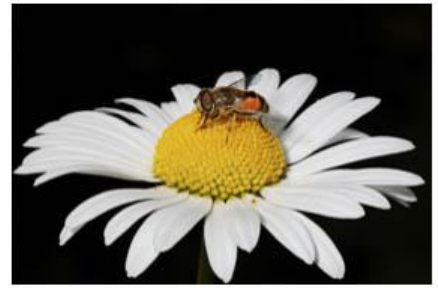
3 Bee - Bill Schwarz