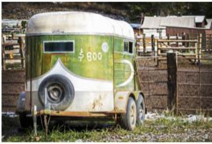
1 $800 - Sonya Lang