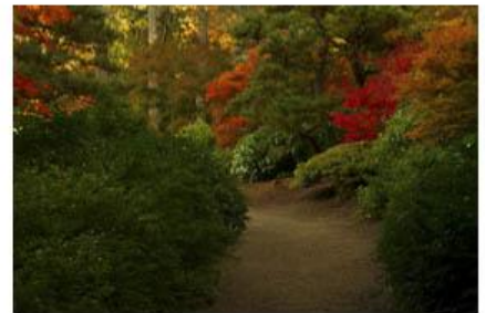
6 Green With a Side of Fall - Sherrie Tallman