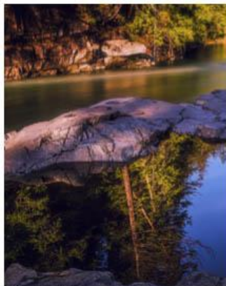
14 Reflections of Fall - Juan Stout