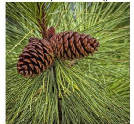
12 Pine Green - Sonya Lang