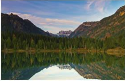
13 Gold Creek Pond - Sherrie Tallma