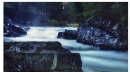
6 Eagle Falls in The Fall - Juan Stout