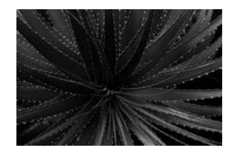
"Aloe Starfield" © Bob Birnbaum