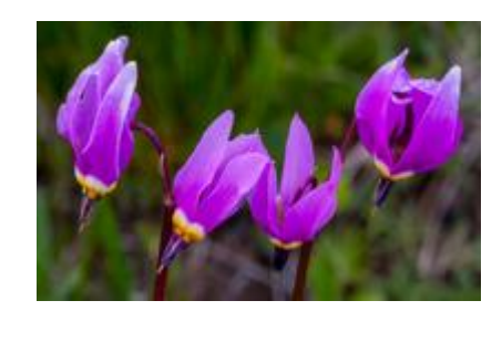
"Shooting Star Quartet" Steve Lightle