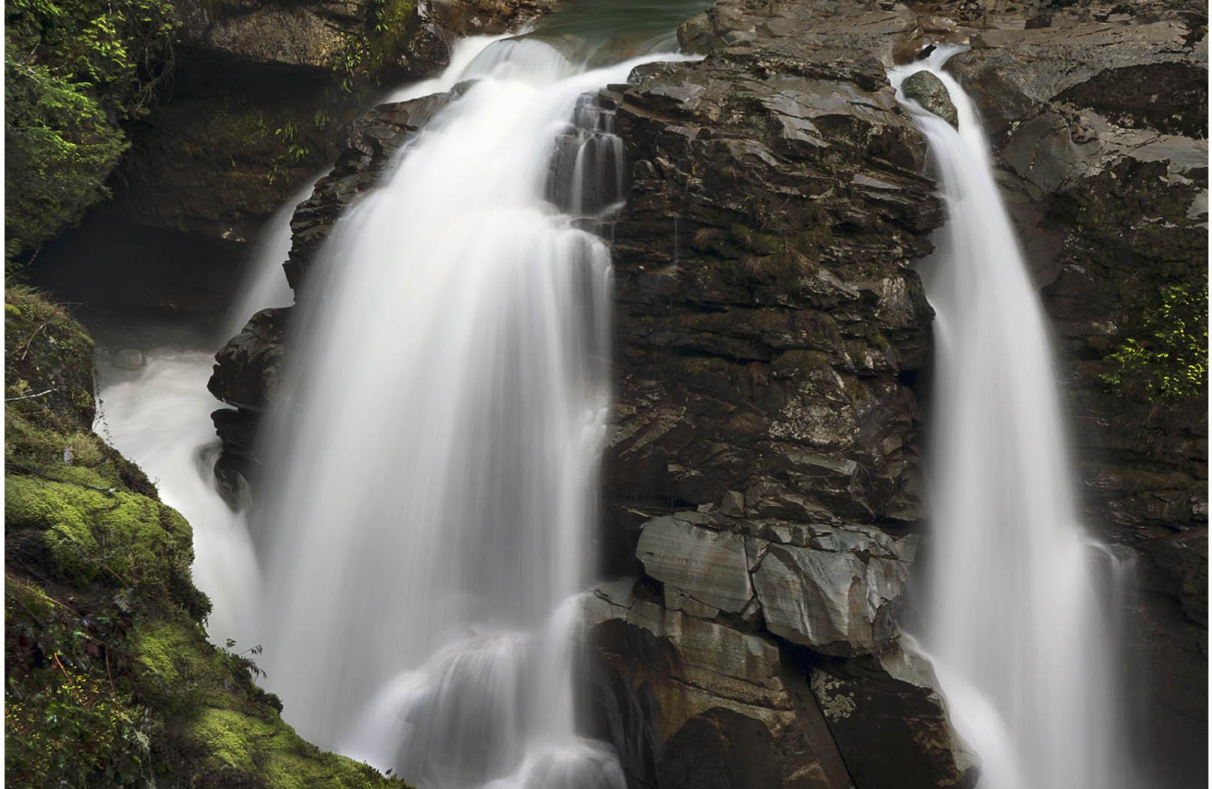
12 Nooksack Falls - Renata Kleinert