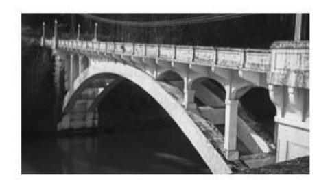
1 Concrete WA Bridge - Don Elliott