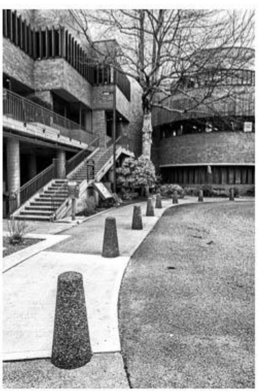
2 Edges and Curves - Sonya Lang