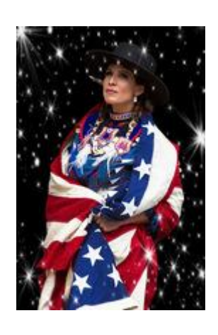
"Red White And Blue" © Renata Kleinert