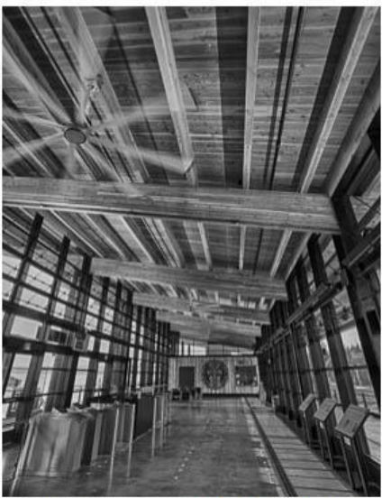
8 Mukilteo Terminal - Bill Schwarz