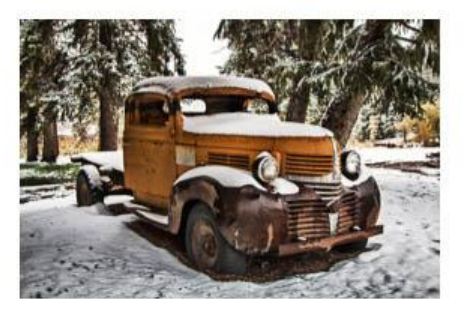
9 Yard Truck - sonya lang