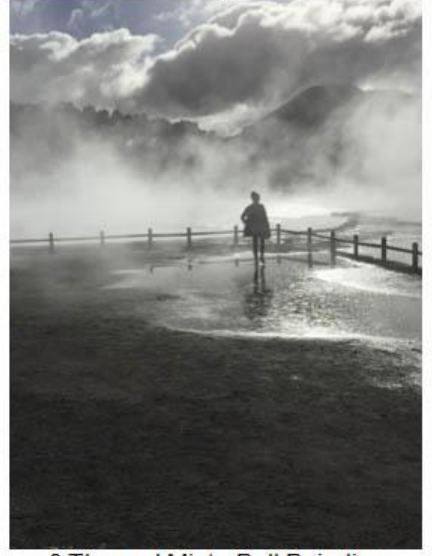
8 Thermal Mist - Dell Deierling