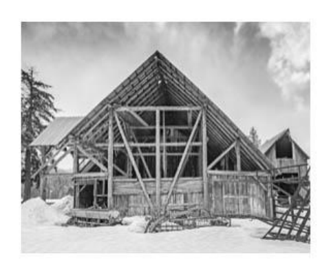
9 Plain WA Barn - Don Elliott