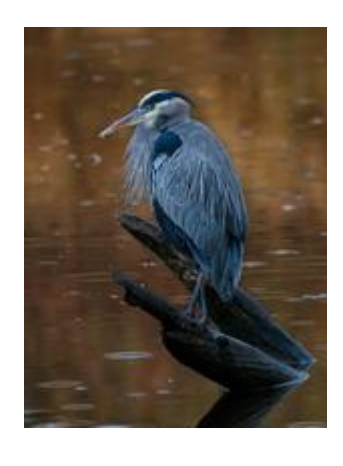
"Heron" © Bill Schwarz