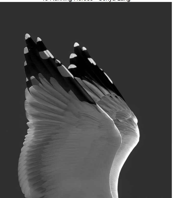
15 The First Gull Wings - Bill Schwarz