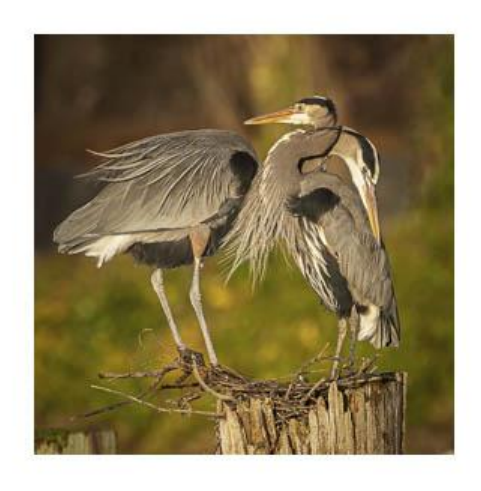
22 Wipe your feet - Doug Goodman