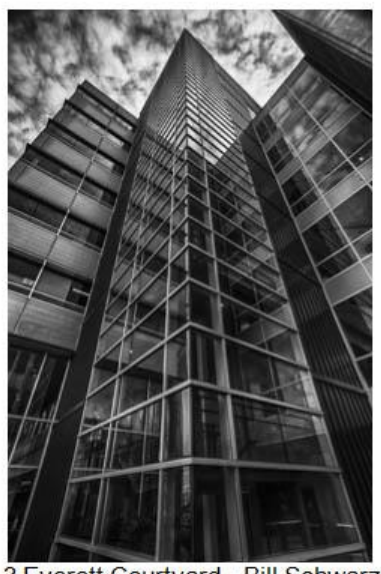
3 Everett Courtyard - Bill Schwarz