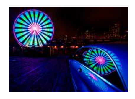
"Great Wheel Reflection 2"