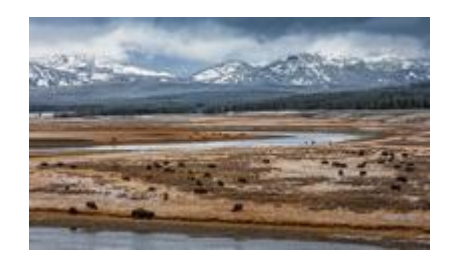
"Yellowstone" Bill Schwarz