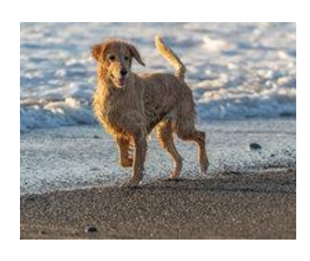
"March" © Doug Goodman