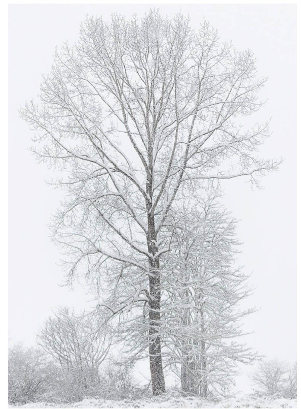
19 Cottonwood in Snow - Don Elliott