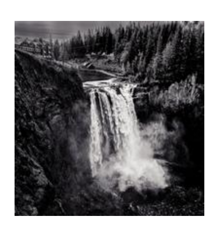
"Snoqualmie Falls In Splendid Black & White" © Juan Stout