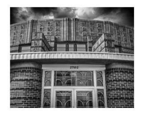
4 Everett Library - Bill Schwarz