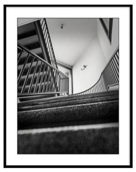
10 Plain WA Church - Don Elliott