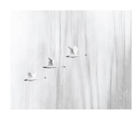
7 Swans in the Mist - Bill Schwarz