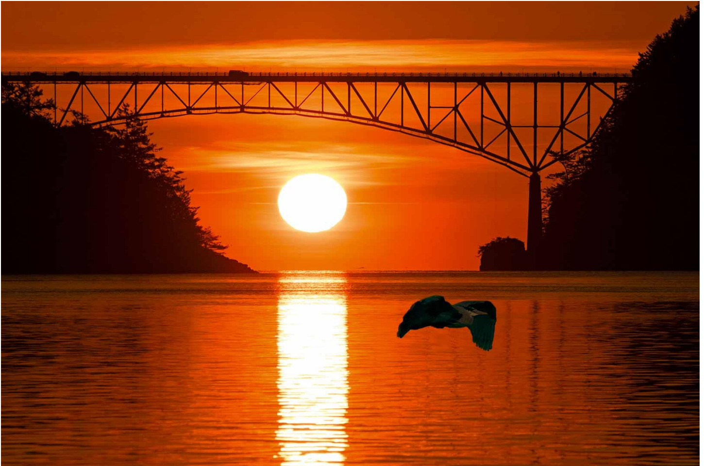
Cover Image: Deception Pass Bridge March Equinox - Renata Kleinert

All images in the newsletter are property of the photographer and all rights are reserved.