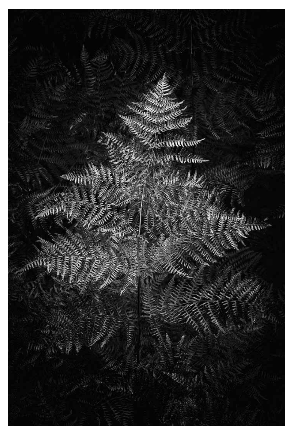
Cover Image: Fern in Black and White – Don Elliott

All images in the newsletter are property of the photographer and all rights are reserved.