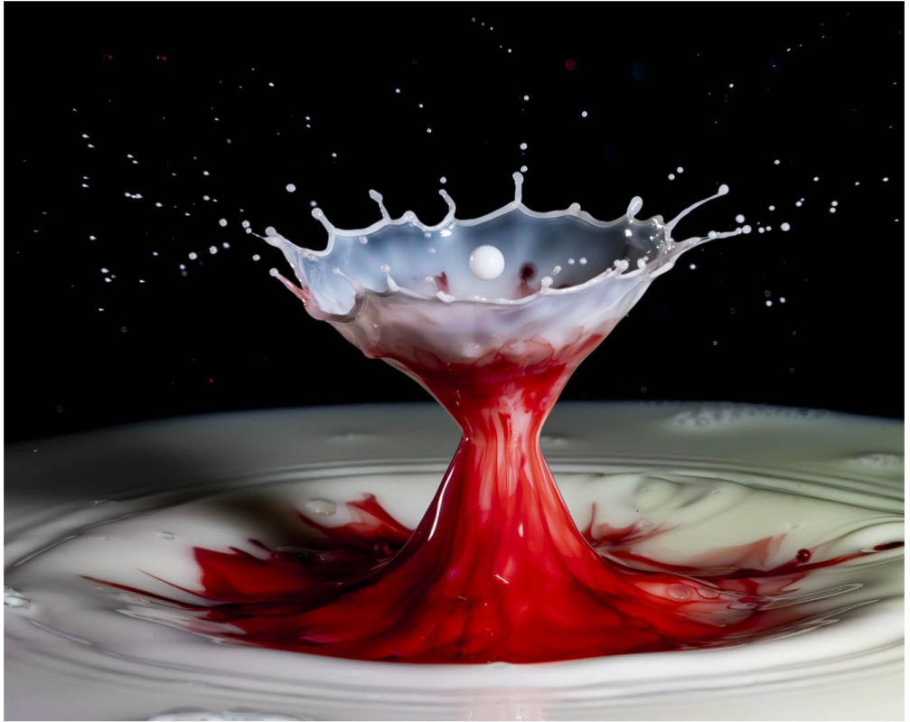
2 Blood Red - Steve Lightle