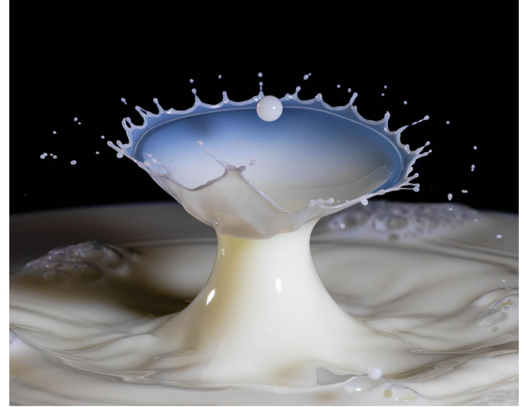
8 Blue Rimmed Splash - Steve Lightle