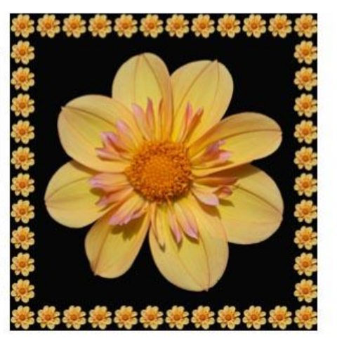
7 Splash Down - Bill Schwarz