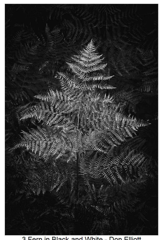
3 Fern in Black and White - Don Elliott