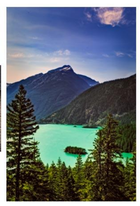
6 North Cascades Summer - Juan Stout

4 Highwood Lake Reflections - Sherrie Tallman