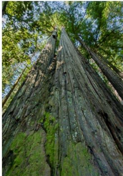
13 To the Canopy - Kevin Siefke