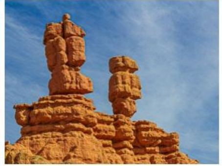
3 Extra Balance - Roger Patterson.jpg