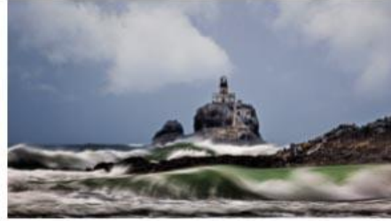
15 Look to the Tree Tops - Tracy Carso 17 Tillamook Rock In Stormy Seas - Ju