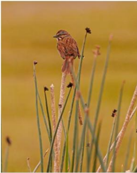
16 Red Winged Black Bird Female - Ju