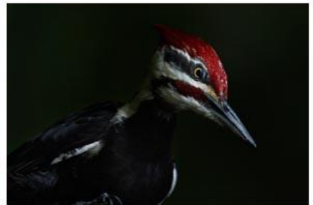
12 Pileated Woodpecker in low key - S