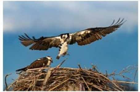
15 Osprey With Fish - Steve Lightle