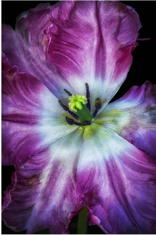
19 Tulip - Sonya Lang