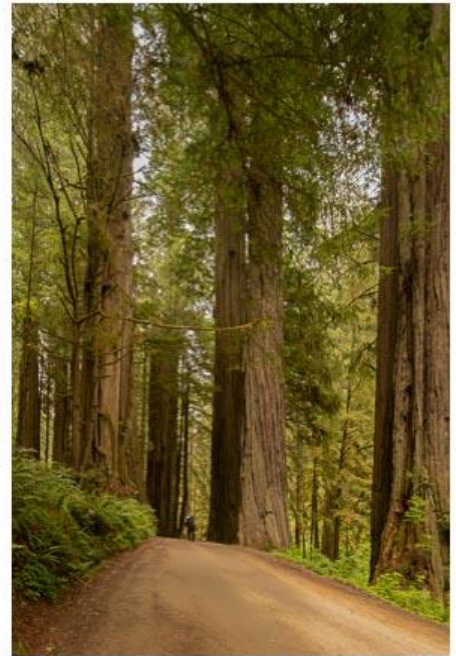
7 Shooting the Redwoods - Kevin Siefke