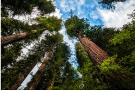
2 Big and Tall Sequoia Trees - Sonya Lang