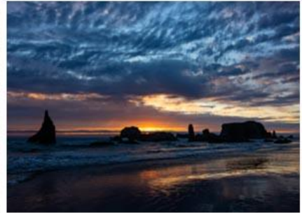
11 Fire in the Sky - Tracy Carson