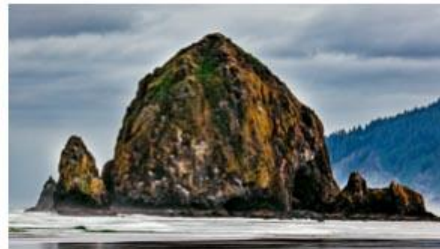
6 Haystack Rock - JuanStout