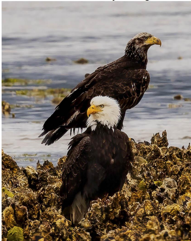
10 Looking Forward Looking Back - JuanStout