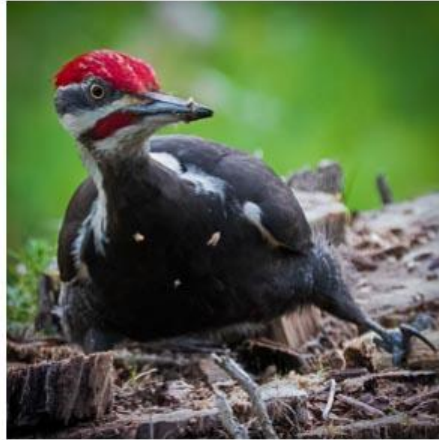
2 Chips Flying - Bill Schwarz