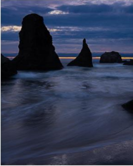
1 Bandon Beach - Kevin Siefke