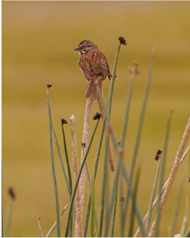
16 Red Winged Black Bird Female - Juan Stout