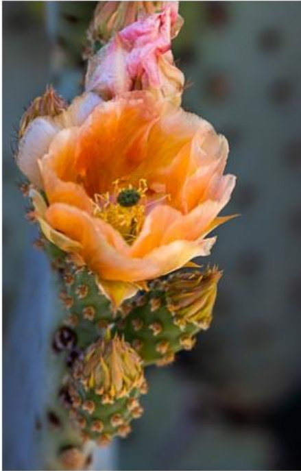
13 Prickly Pear - Tracy Carson