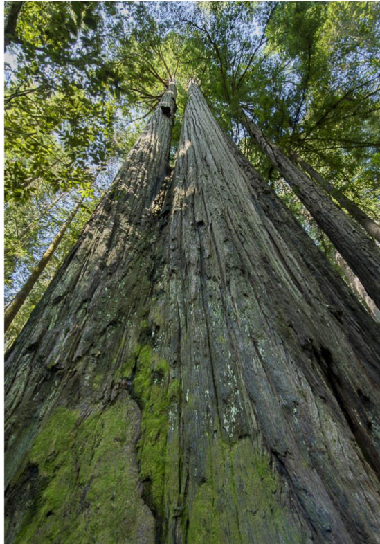
17 To the Canopy - Kevin Siefke