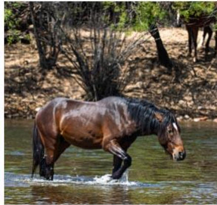
20 Wild and Free - Tracy Carson