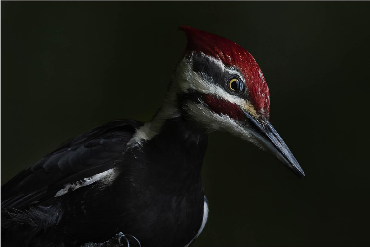
12 Pileated Woodpecker in low key - Sonya Lang