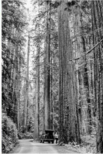
9 Big Redwood Trees - Sonya Lang