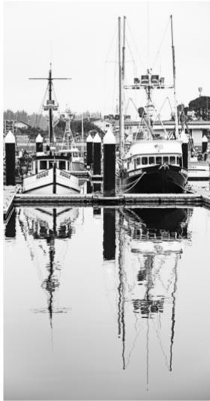
8 Crescent City Harbor - Kevin Siefke