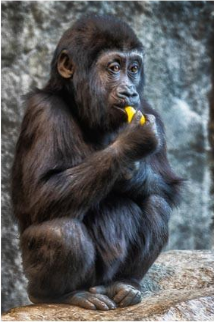
7 Kitoko - Sonya Lang