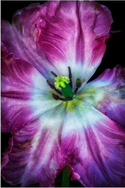
19 Tulip - Sonya Lang