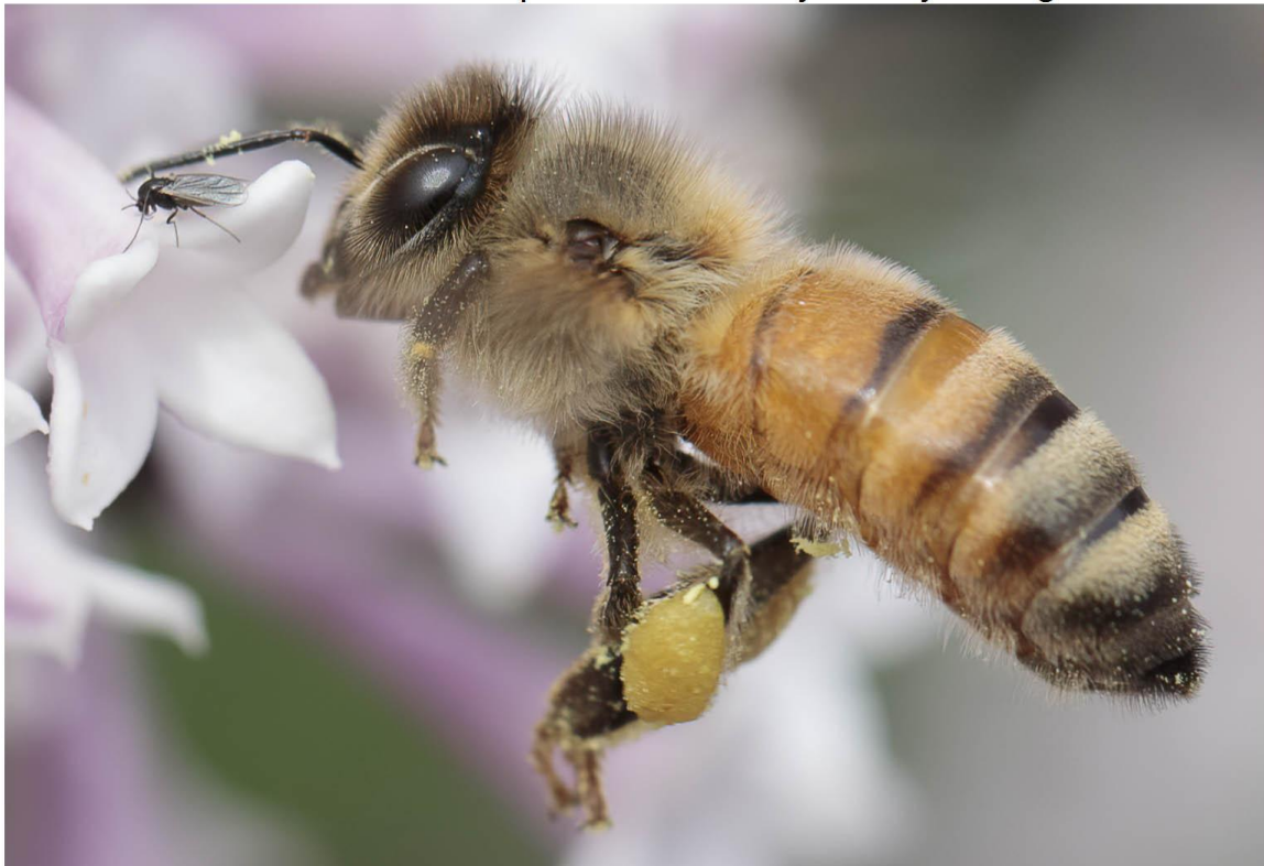
14 ShooFly - Bill Schwarz