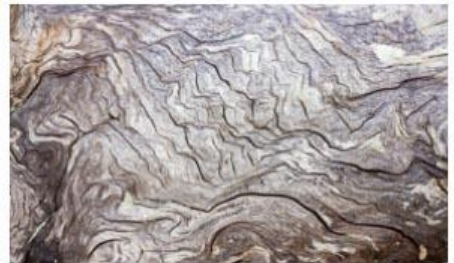
18 Topography - Roger Patterson.jpg