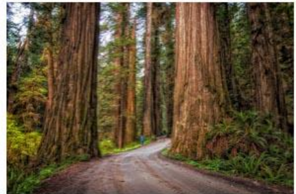
14 Jedediah Redwoods - Sonya Lang