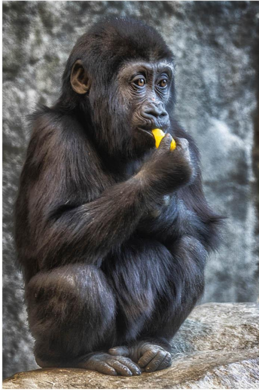
7 Kitoko - Sonya Lang