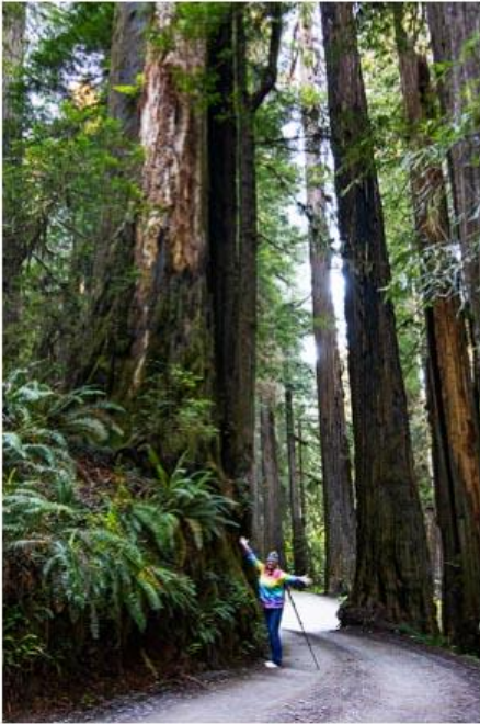
5 Celebrating the Grandeur - Tracy Carson