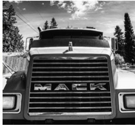
3 Big Mac - Steve Lightle