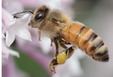
14 Shoofly - Bill Schwarz