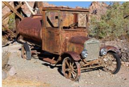
11 Old and Dry - Roger Patterson.jpg