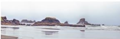
12 Hole In The Rock At Indian Beach -