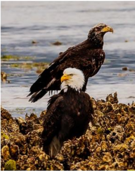
10 Looking Forward Looking Back - Ju