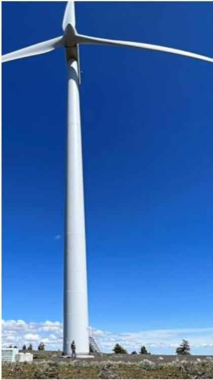
8 Wild Horse Wind Turbine - Dell Deierl