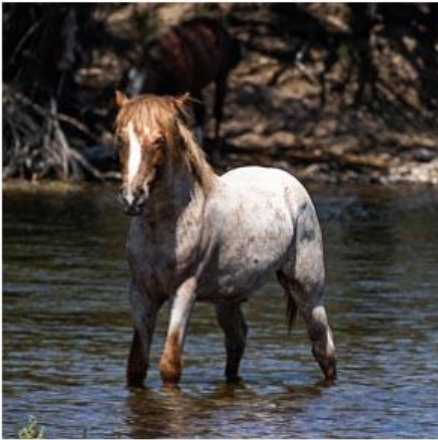
4 Hello Beautiful - Tracy Carson