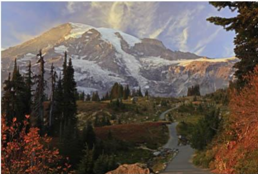
3 Golden Sunset on Rainier - Sherrie Tallman