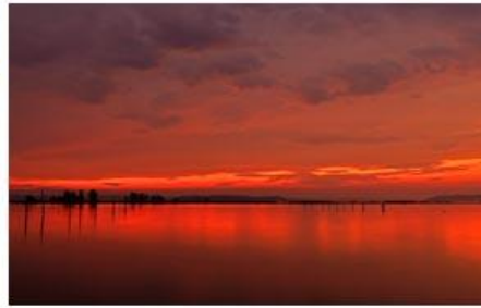
11 Smoke and Fire - Sherrie Tallman