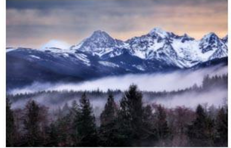
1 Cascades Dressed in Snow And Fog - Juan Stout