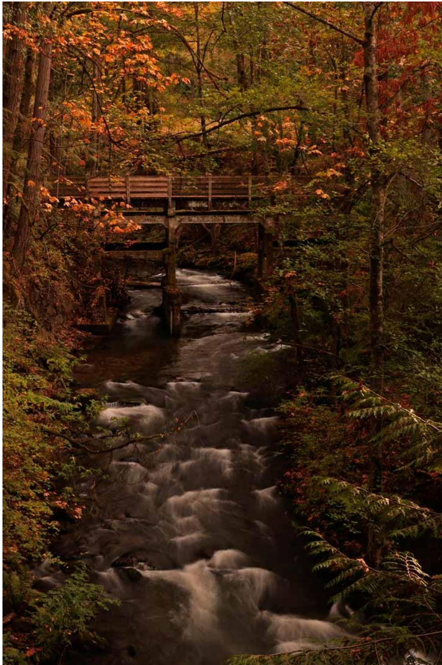
Cover Image: Fall at Whatcom Creek

All images in the newsletter are property of the photographer and all rights are reserved.