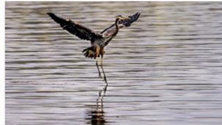
14 Toe Touch Reflection - Juan Stout