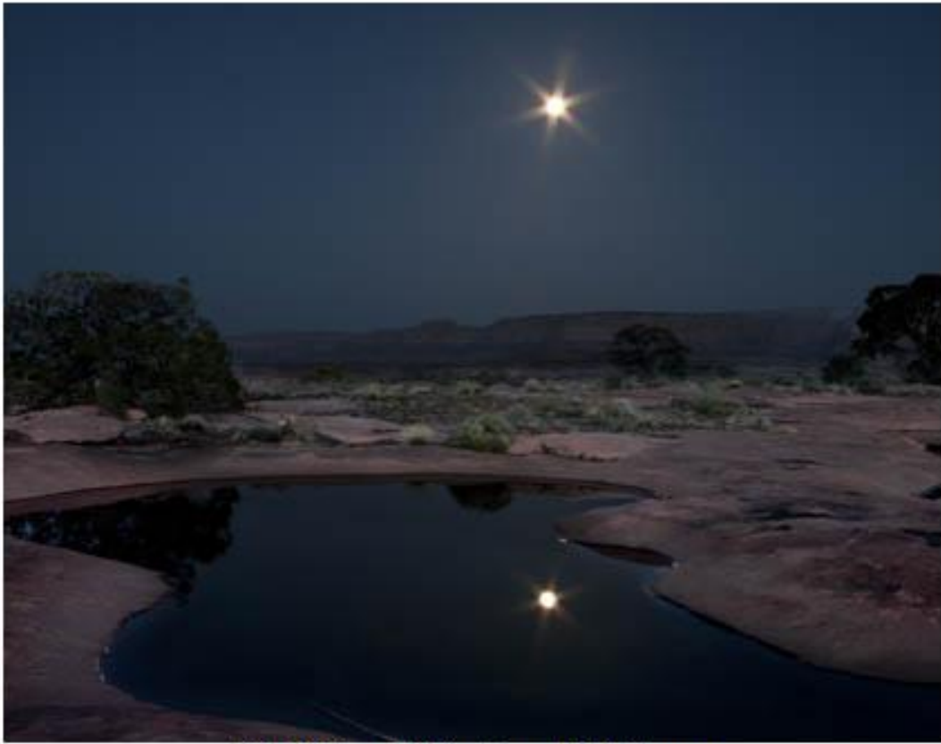
15 TuWeepReflection - Bill Schwarz