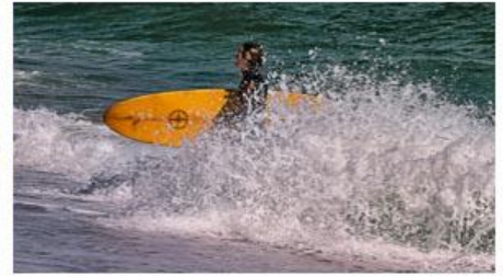
10 Exit The Surfer - Juan Stout