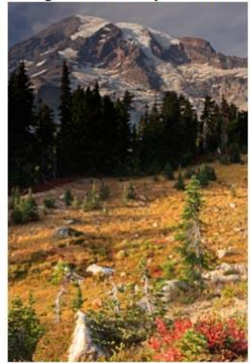
13 The Mountain Was Out - Sherrie Tall