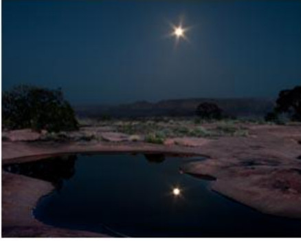
15 TuWeepReflection - Bill Schwarz