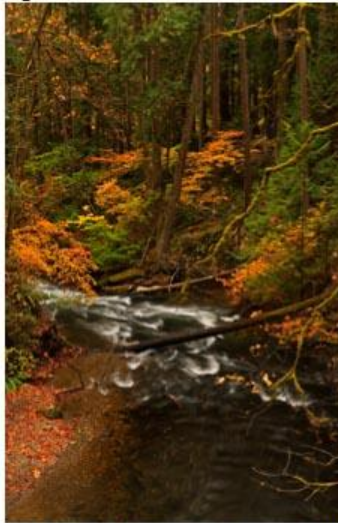
9 View from a Bridge - Sherrie Tallman