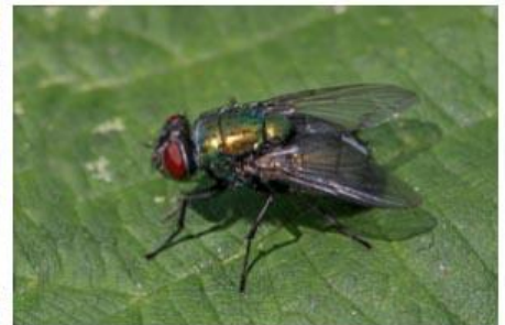
10 Shoo Fly - Bill Schwarz