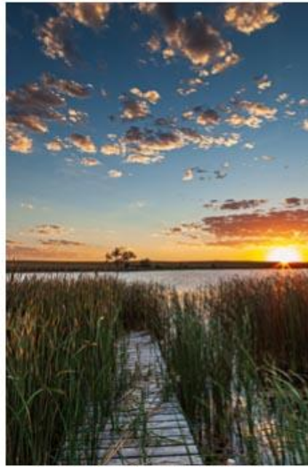
5 Old Dock - Bill Schwarz