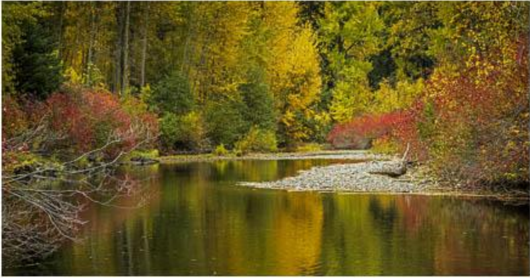
7 Little bit of Fall - Sonya Lang