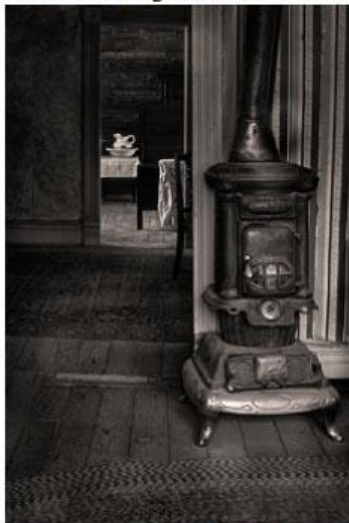
2 Cozy Home - Sonya Lang