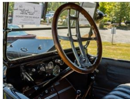
8 Off Center - Roger Patterson