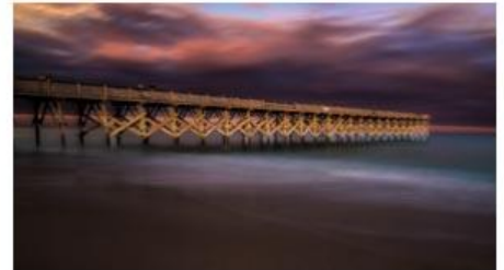
1 Crystal PierWrightsville Beach - Juan Stout