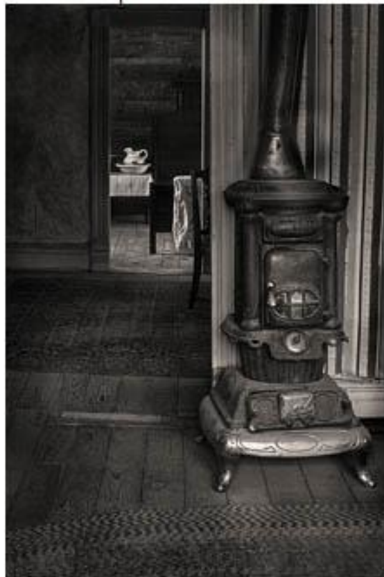
2 Cozy Home - Sonya Lang