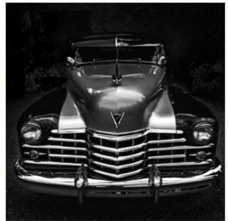
16 Vintage Cadillac - Sonya Lang