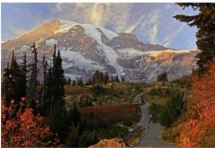
3 Golden Sunset on Rainier - Sherrie T