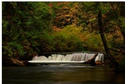
12 Whatcom Creek Color - Sherrie Tallman