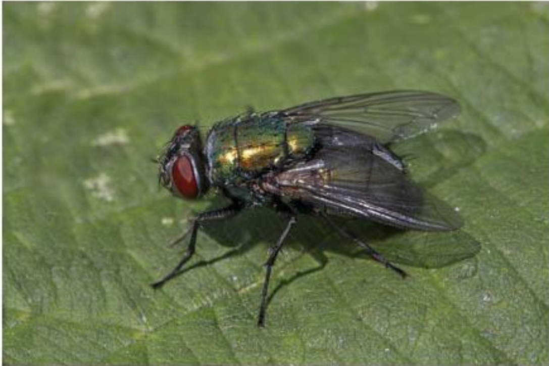
10 Shoo Fly - Bill Schwarz