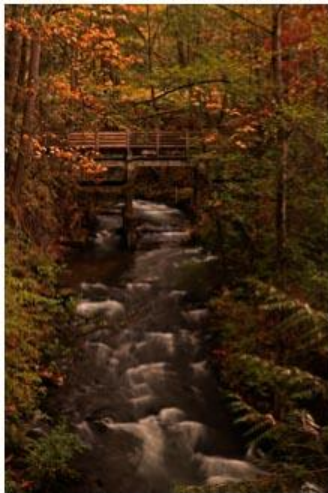
3 Fall at Whatcom Creek - Sherrie Tallman