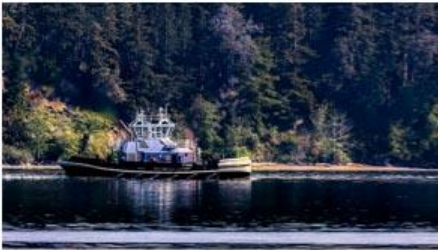
9 Seabeck Tug Boat - Juan Stout