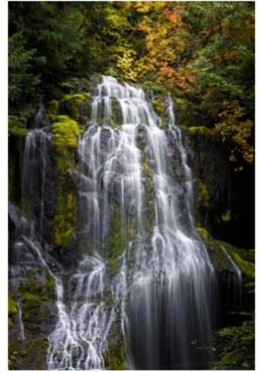
4 Panther Creek Falls