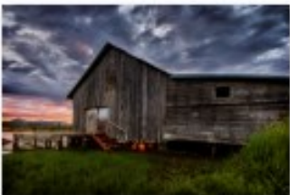
13 Skagit Boat House - Sonya Lang