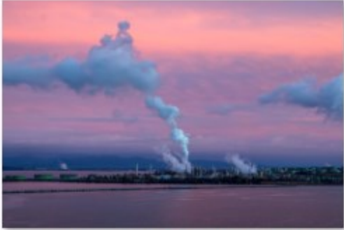
1 Anacortes Oil Refinery - Sonya Lang