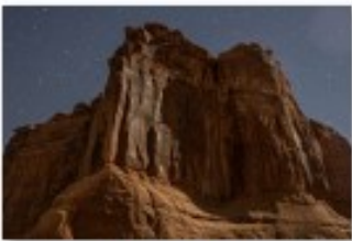
9 Pic2 - Roger