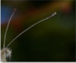
1 Antenna - Bill Schwarz