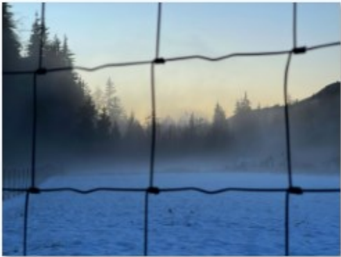
3 Field Fog - Dell Deierling