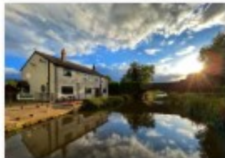
14 Slade Heath Bridge - Dell Deierling