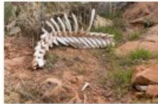
11 Pic3 - Roger