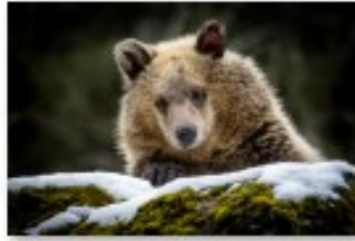
2 Fern - Sonya Lang