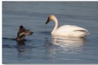
6 Get Away - Bill Schwarz