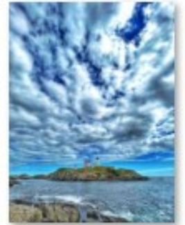
8 Nubble Lighthouse - Dell Deierling