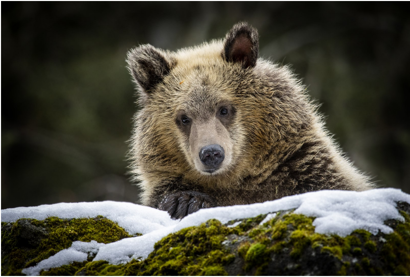
First Place Fern, Juniper & Boat House By Sonya Lang