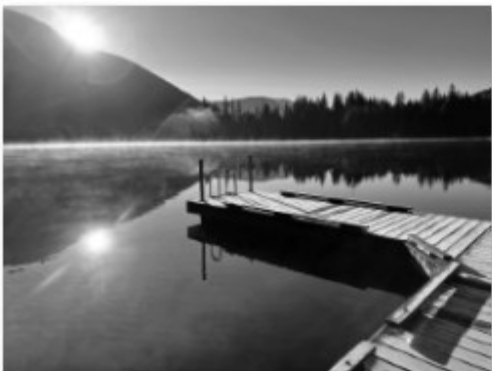
5 Lake Riley Mist - Dell Deierling