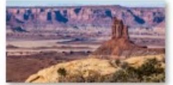
4 Pic1 - Roger