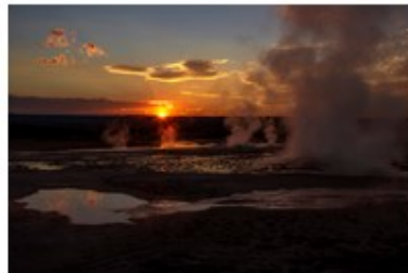
"Yellowstone Sunset"