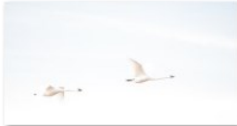
20 Swan High Key - Bill Schwarz