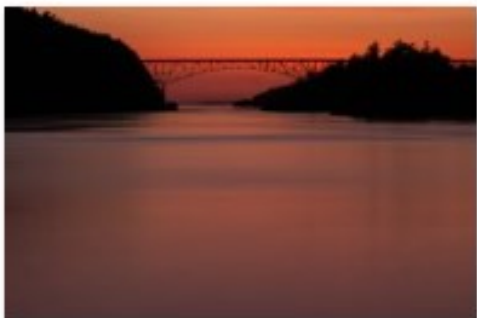
25 Serenity - Steve Lightle