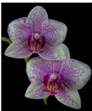
"Orcut" © Renata Kleinert