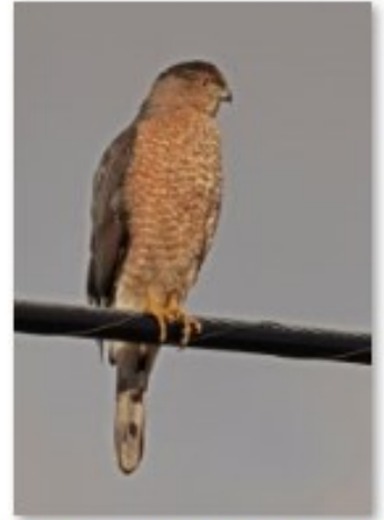
3 Cooper's Hawk - Sherrie Tallman