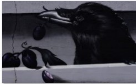
17 Raven - Sherrie Tallman