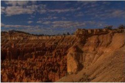
"Bryce by Night"