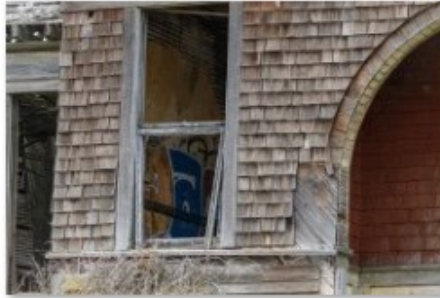
29 Window with a View - Deb Smith