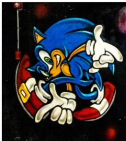
10 Sonic 1 - Steve Lightle