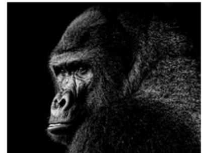
"Louisville Gorilla Portrait"