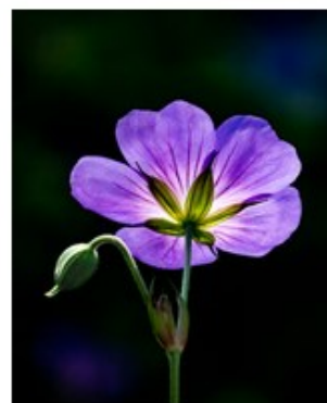
"Black Floral" © Steve Lightle