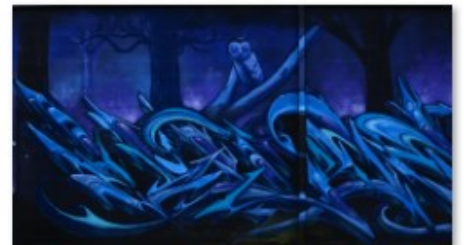
9 Owl Be Waiting - Sherrie Tallman