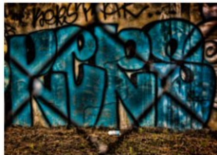
8 Kenos Fenced In_Juan Stout - No Name