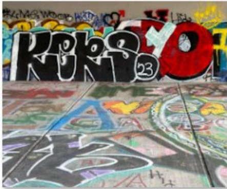
1 23 - Bill Schwarz