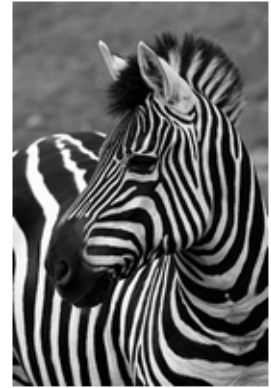
"Stripes" 9 PSA Pts