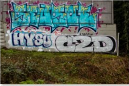
25 Residential wall - Roger Patterson