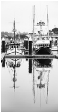
"Crescent City Harbor"