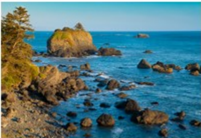
"Pebble Beach Drive"