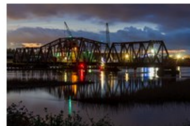
"Steamboat Slough Railroad Bridge"