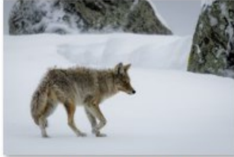
2 Cold Coyote - Deb Smith