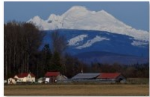
24 Red Roof Farm - Sherrie Tallman