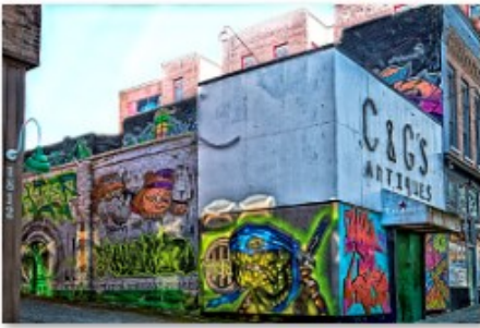
13 Everett Graffiti Art - Sonya Lang