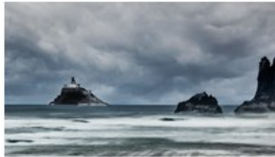
"Terrible Tilly From Canon Beach" © Juan Stout