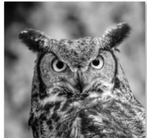
6 Great Horned Owl - Steve Lightle