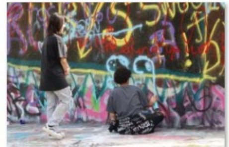
21 Girls having fun