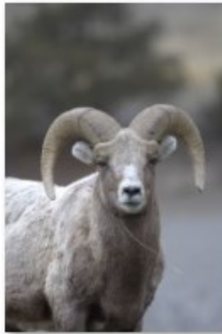
14 Good Grass - Deb Smith