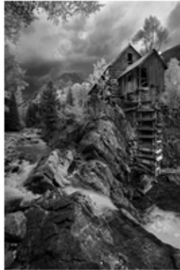
"Crystal Mill"