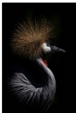
"Crane's Hairdoo" © Sonya Lang