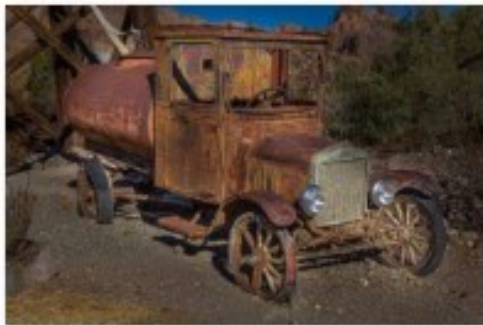
17 Old and Dry - Roger Patterson