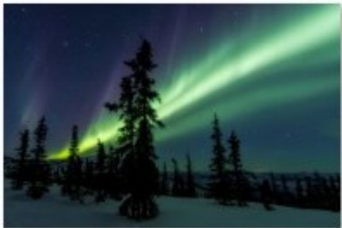
16 Northern Lights March 2023 - Sonya Lang