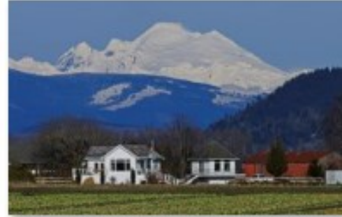
12 Farm Life With a View - Sherrie Tallman