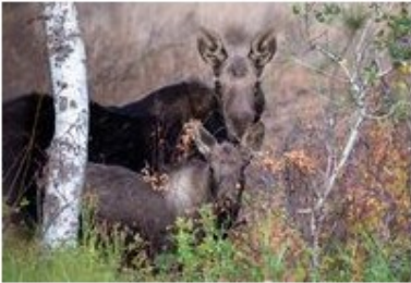
"Cow & Calf"