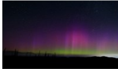
"Lion's Rock Lights"