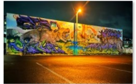
6 DinoGraf - Dell Deierling