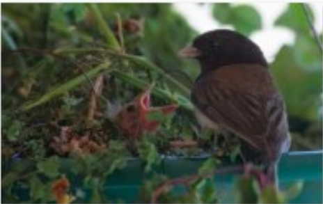
4 Feed Me - Bill Schwarz