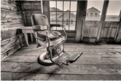
"Barber Shop" © Sonya Lang