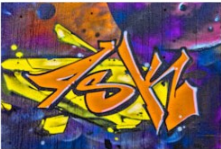
19 Solar Graffiti_Juan Stout - No Name