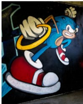
20 Sonic 2 - Steve Lightle