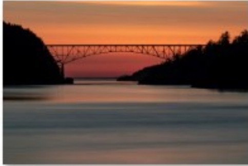
11 Solstice Sunset - Tracy Carson