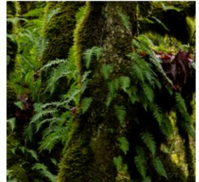
"Spring Growth"