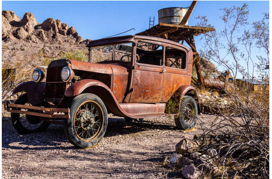
Second Place No Paint Roger Patterson