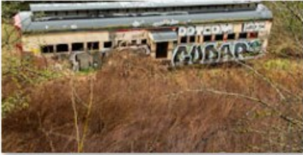
16 Pullman car - Roger Patterson