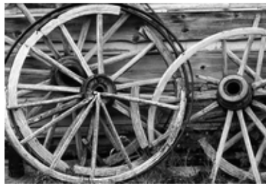
"Nevada city wheels" © Steve Lightle