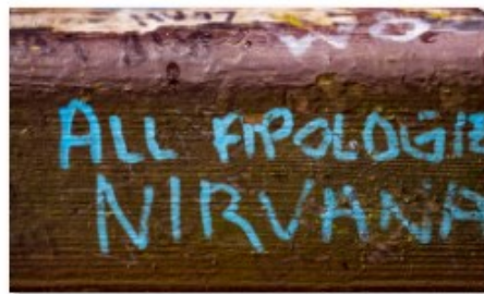
2 All Apologies - Tracy Carson