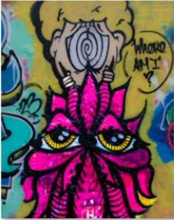
28 Where Am I - Steve Lightle