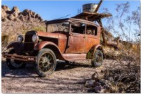
10 No Paint - Roger Patterson