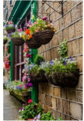
"English Ale House"