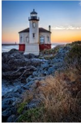
"Coquille Lighthouse Bandon OR"