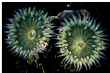
"Anemone Glow"