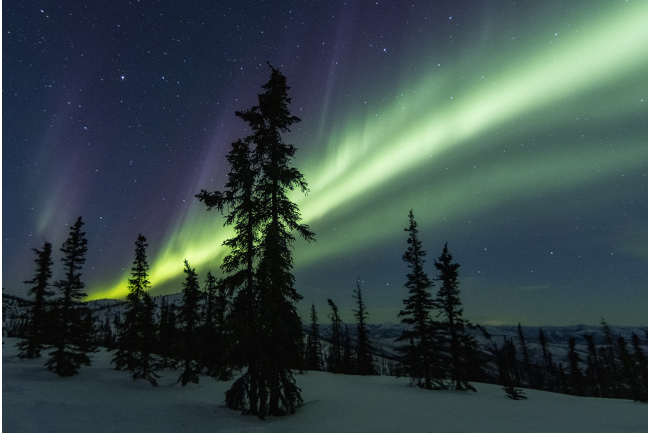
First Place Northern Lights March 2023 Sonya Lang