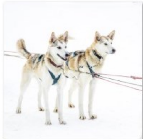
27 Sled Dogs Waiting - Sonya Lang