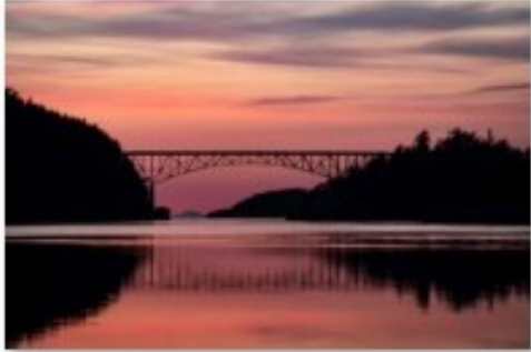
19 Solstice Sunset 1 - Tracy Carson