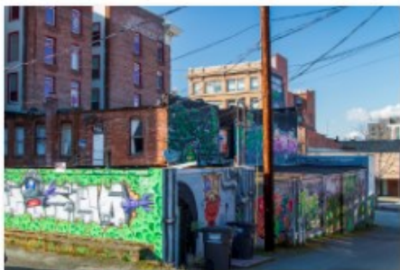
7 Everett Graffiti Art 2 - Sonya Lang