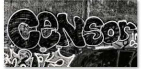
27 The Word For Today_Juan Stout - No Name