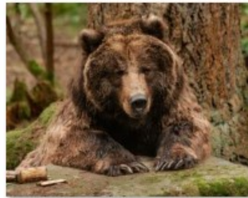
15 Grizzly - Steve Lightle