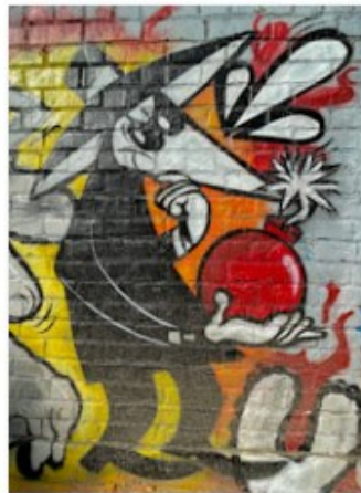
23 I Spy - Bill Schwarz