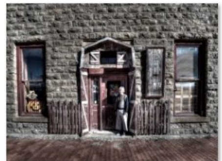
28 the soapstress - Tim Garton