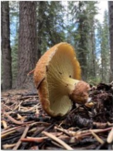
10 Felled Bolete - Dell Deierling