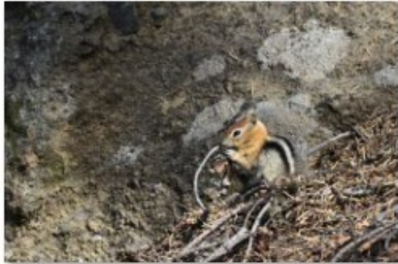
2 Campsite Critter - Sherrie Tallman