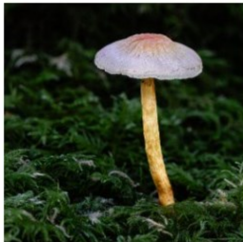
8 Solitary Mushroom Steve Lightle - No Name