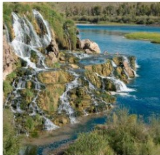
5 Fall Creek Falls - Kevin Siefke