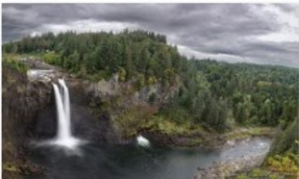
26 Snoqualmie Falls2 - Bill Schwarz