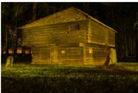
7 Fort Borst Blockade - Roger Patterson