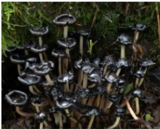
12 Licorice Mushrooms - Bill Schwarz