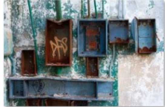
12 Dysfunctional - Steve Lightle