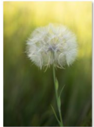
15 Goatsbeard - Kevin Siefke