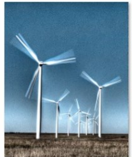
6 fans - Tim Garton