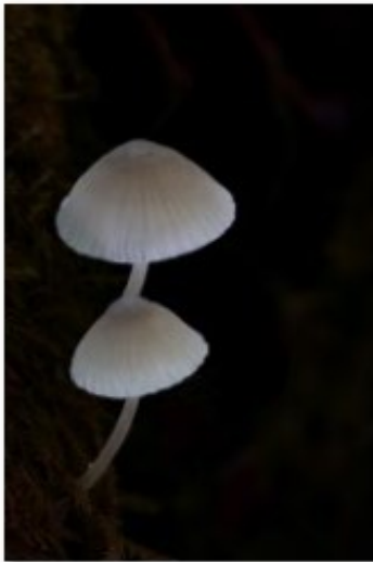
13 Mushroom Glow - Steve Lightle