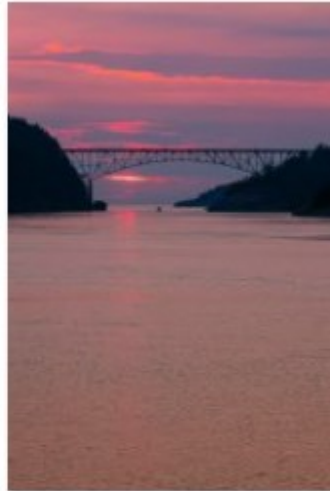
20 Fall Equinox 2023 - Steve Lightle