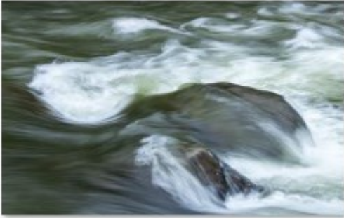
19 Raging River - Roger Patterson