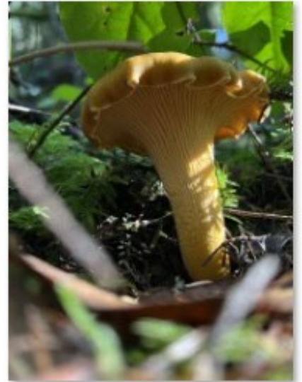
3 Chanterelle - Dell Deierling