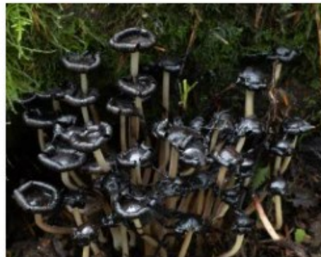
8 Licorice Mushrooms - Bill Schwarz