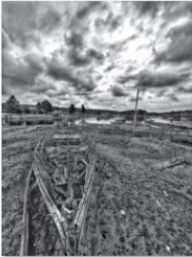
10 Skeleton Boat - Dell Deierling