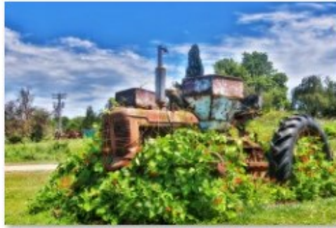
2 Blending In - Sonya Lang