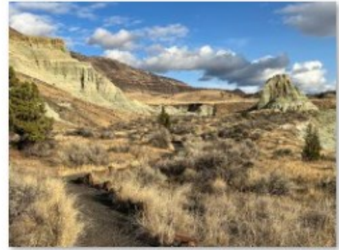
3 Blue Basin 2 - Sherrie Tallman