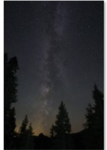
21 Milky Way from Chinook Pass