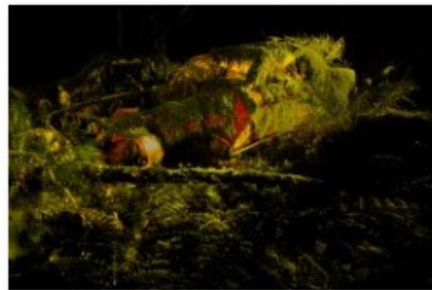
14 Reclamation in progress - Roger Patterson