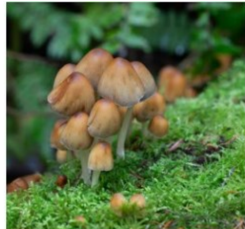
18 Mushroom Cluster - Bill Schwarz