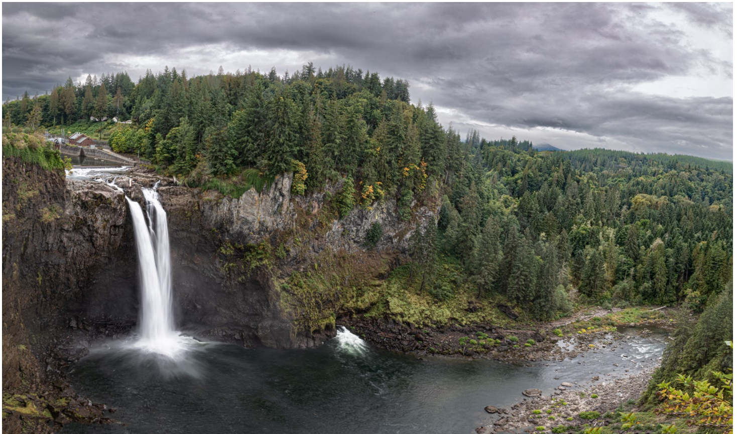
Second Place Snoqualmie Falls 2 Bill Schwarz