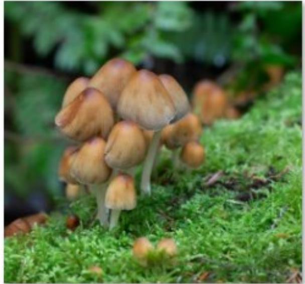
18 Mushroom Cluster - Bill Schwarz