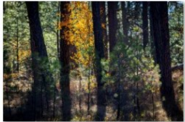
6 Forest Floor 1 - Sonya Lang