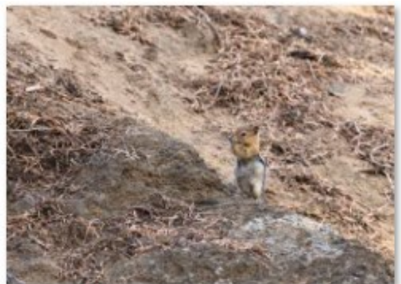
16 Having a Snack - Sherrie Tallman