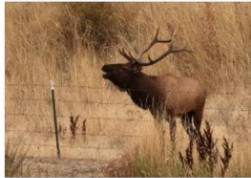
14 Elk in Rut - Sherrie Tallman