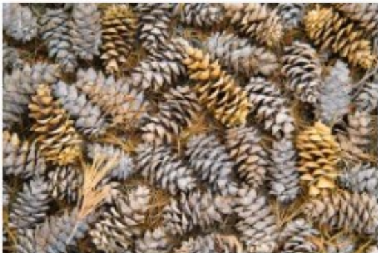
7 Limber Pine Cones - Kevin Siefke