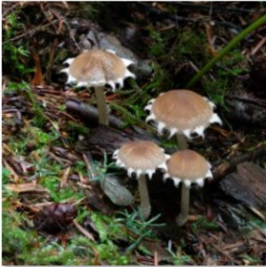
4 Crown Mushroom - Bill Schwarz