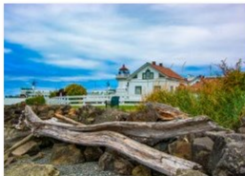
17 Mukilteo Lighthouse - Cheryl Stiteler