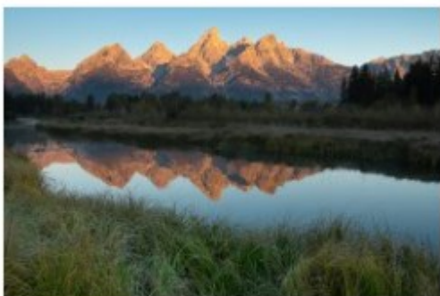
25 Schwabacher Sunrise - Kevin Siefke