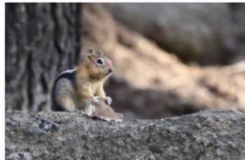
9 Chipmunk on Boulder - Sherrie Tallman