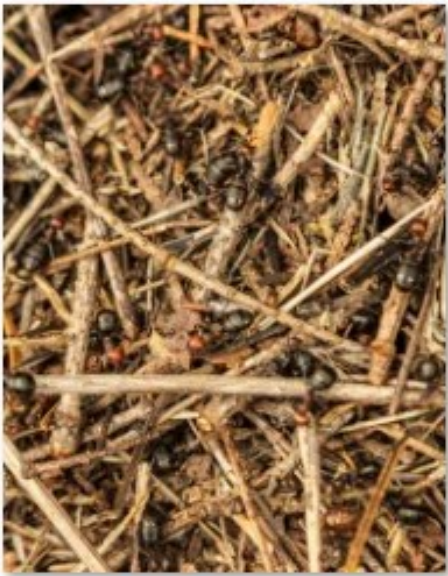
1 Ant hill - Roger Patterson