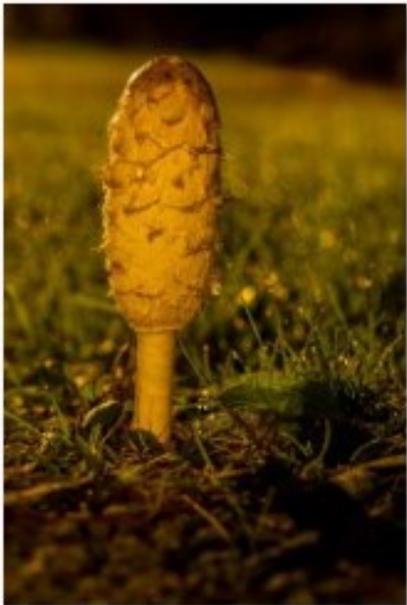
19 Tall Shroom - Roger Patterson