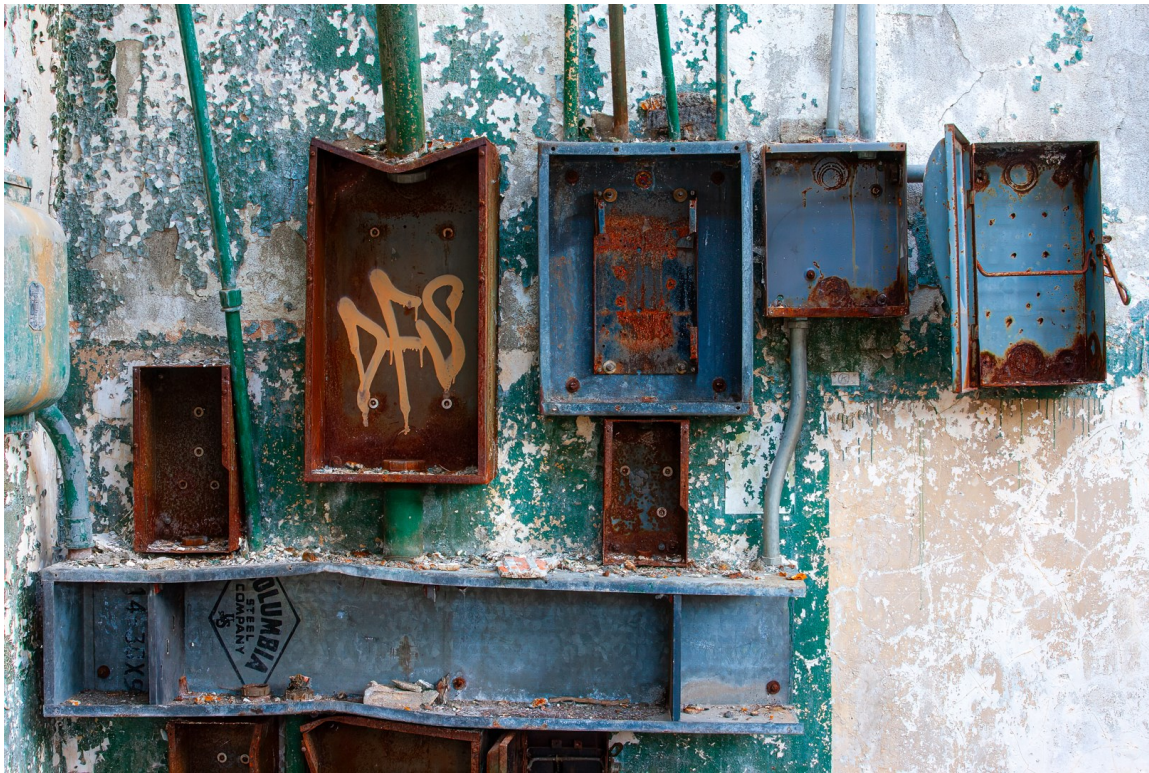
First Place Dysfunctional Steve Lightle