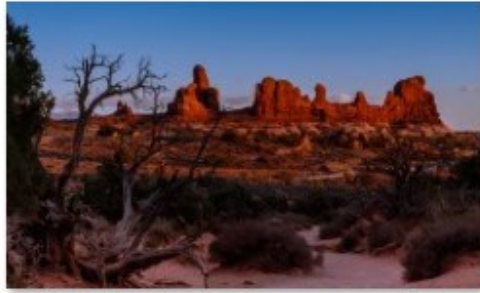
1 Arches Sunset - Steve Lightle