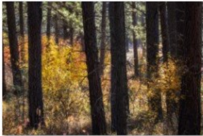
11 Forest Floor 2 - Sonya Lang