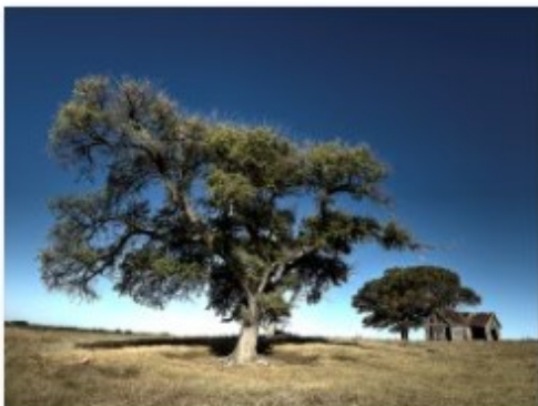
16 homestead - Tim Garton