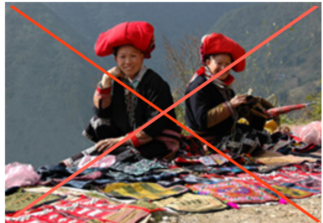
Image manipulation by removing, moving or adding objects is often difficult to spot and to prove. When judges suspect a violation that should be investigated.

The only allowable adjustments are removal of dust or digital noise, restoration of the appearance of the original scene, and complete conversion to greyscale monochrome. Other derivations, including infrared, are not permitted. All images must look natural.